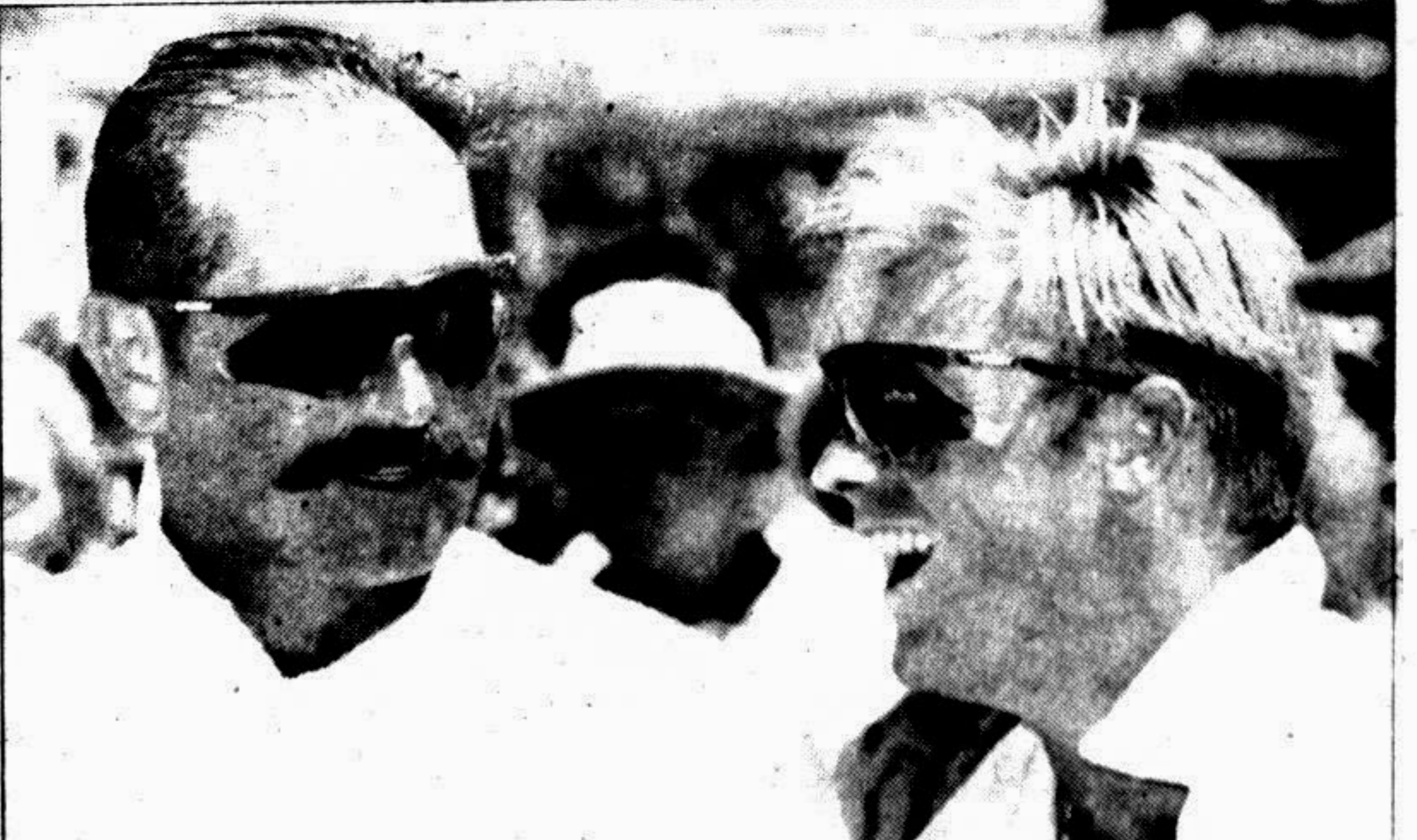
England's veteran campaigner Graham Gooch (L), who has announced his retirement from Test cricket, shares a joke with Aussie master leggie Shane Warne during the presentation ceremony at the end of the fifth Test in Perth yesterday.