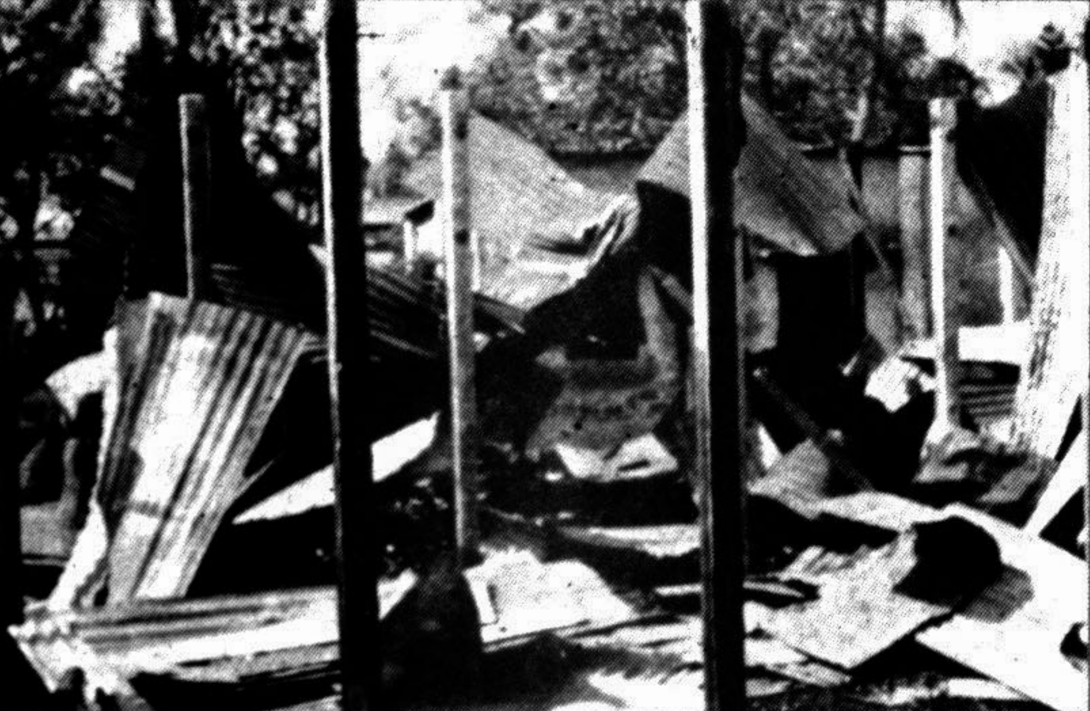
NARAYANGANJ: An armed gang of youths created a reign of terror when they attacked Kaitakhali village under bandar thana recently. The youths reportedly belong to a gang led by Sabbar who was killed in a recent gun fight. The miscreants set ablaze 23 houses and prevented the fire brigade men from entering the village until the houses were burnt to ashes. The photo shows some of the damaged houses.

NATORE, Feb 7: At least 30,000 acres of land are being used in brick manufacturing in Natore and adjacent districts, according to a survey conducted by a non-government body, reports UNB. Increasing number of brickfields have become a threat to the environment as every day thousands of immature trees are being used as firewood in these fields. A good number of flower and fruit-bearing trees are also being burnt for manufacturing bricks. Productivity of land have also been decreased due to the adverse effect of brickfields. In this area, two or three crops were used to produce every season previously. But now it has become impossible to grow crops as fertility of land has been declining gradually in the surrounding areas of brickfields. As a result, farmers are sustaining heavy loss and finding no other alternative they are compelled to mortgage their lands to the brickfield owners. On the other hand, defying government ban, every day a huge quantity of logs from neighbouring districts is being brought to the brickfield areas of Natore where shortage of firewood is prevailing. Brickfield owners said they are compelled to use wood in manufacturing bricks as they can not procure coal at a reasonable price. They alleged that the price of coal imported by government is very high. So, to keep brick prices stable, they use wood which is cheaper than coal. On the other hand, high cost of firewood has been causing immense problems to the common people who use it in cooking.