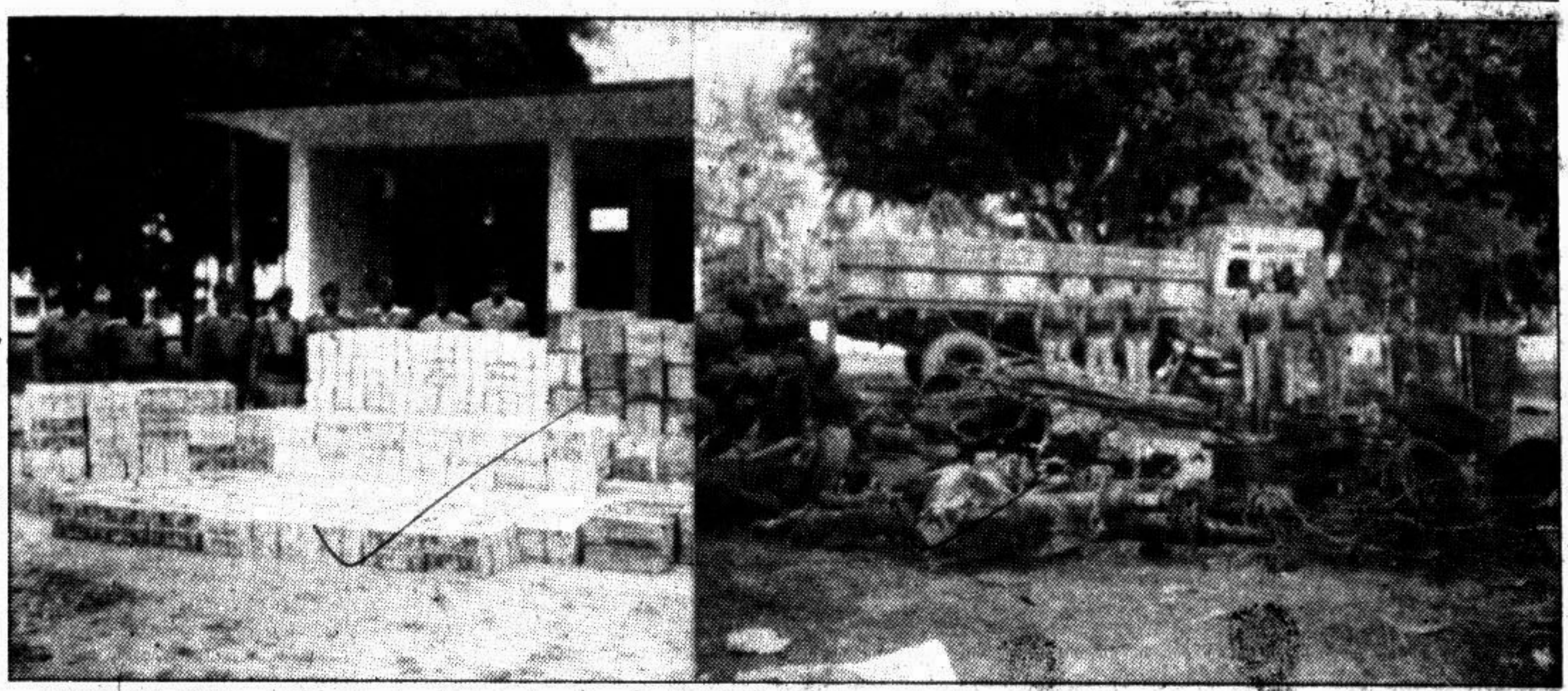
JESSORE: BDR personnel seized contraband goods worth Taka one crore thirty one lakh forty five thousand five hundred ninety six from different border areas of Jessore and Jhenidah districts under operations 'Winter Wolf' during January this year. The photos show some of the seized goods. A total of 39 alleged smugglers were held and 246 cases were recorded in local thanas during the month. The seized goods included wrapper, vehicles, 2182 pieces of motor parts, crocodile skins, one truck, fruits, motor cycles, current net for fishing, cosmetics, radio parts, ammunition, garments, pressure cookers, bi-cycle and bi-cycle parts, fish, crockeries, electric goods, ovens, medicine, machinery parts, hair clip, jewelries, brief cases, wall-clocks, tape-records, phensidyle syrup bottles, cattle, blouze pieces etc.

JHENIDAH, Feb 7: Law and order deteriorated in Kaliganj thana of the district in last one year. According to a source 170 cases were recorded with Kaliganj police last year.