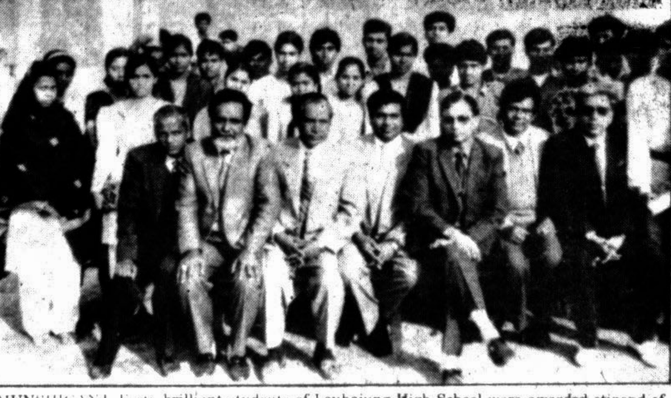
MUNSHIGANJ: Forty brilliant students of Louhajung High School were awarded stipend of Tk 1,000 each by the Manju Bahar Kallyan Trust recently at a simple function. The picture shows some members of the trust with the students.