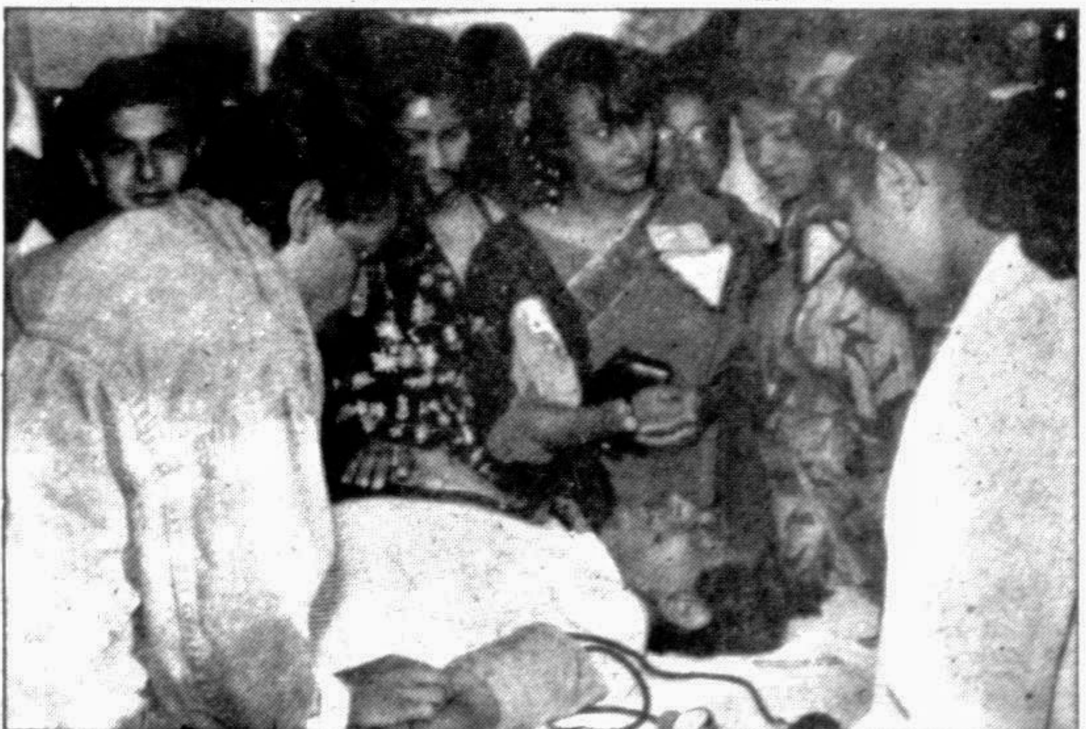
RAJSHAHI UNIVERSITY: The history department of the university organised for a day-long voluntary blood donation programme on the occasion of the department's 40th birth anniversary.

The farm owner informed that sometimes they had to face problem as there is no proper market for selling milk. As a result, sometimes they are compelled to sell the same at the rate of Taka 6.00 to 7.00 a litre for want of customers. He also added that from the dairy farms of Jessore district 2 thousand 5 hundred litres of milk is produced daily. But the quantity is decreasing day by day. The dairy farm owners demanded to install feed mills in Jhenidah, Jessore, Narail and Magura districts to remove the instabilities.