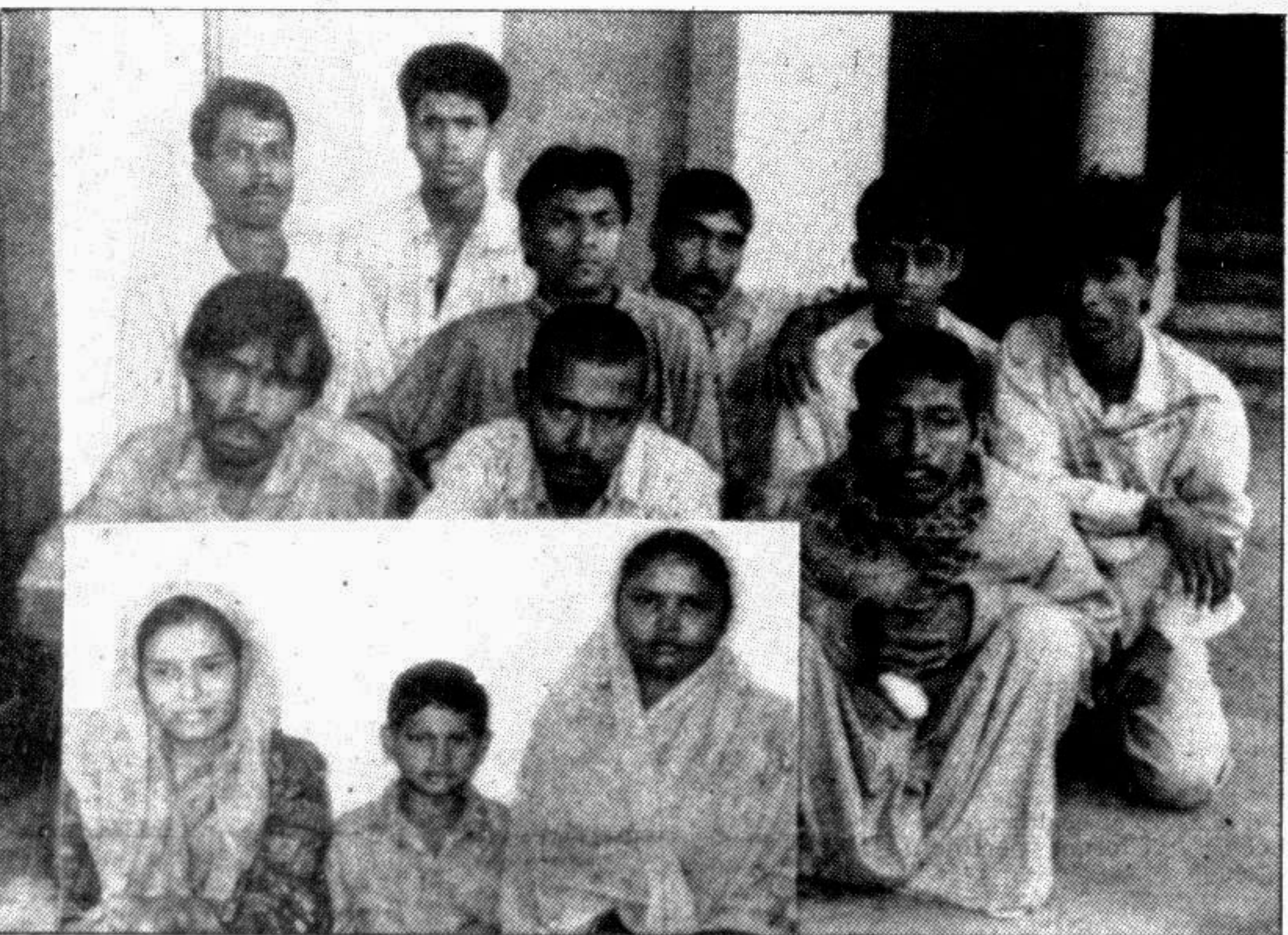
NARAYANGANJ. Narayanganj police arrested 12 pickpockets including two women and a child from the bus and launch terminal areas of the town recently.

According to witnesses, the incident occurred at about 2 pm when two buses collided head on killing Abdur Rauf, 32 on the spot. His body was sent to morgue for autopsy.