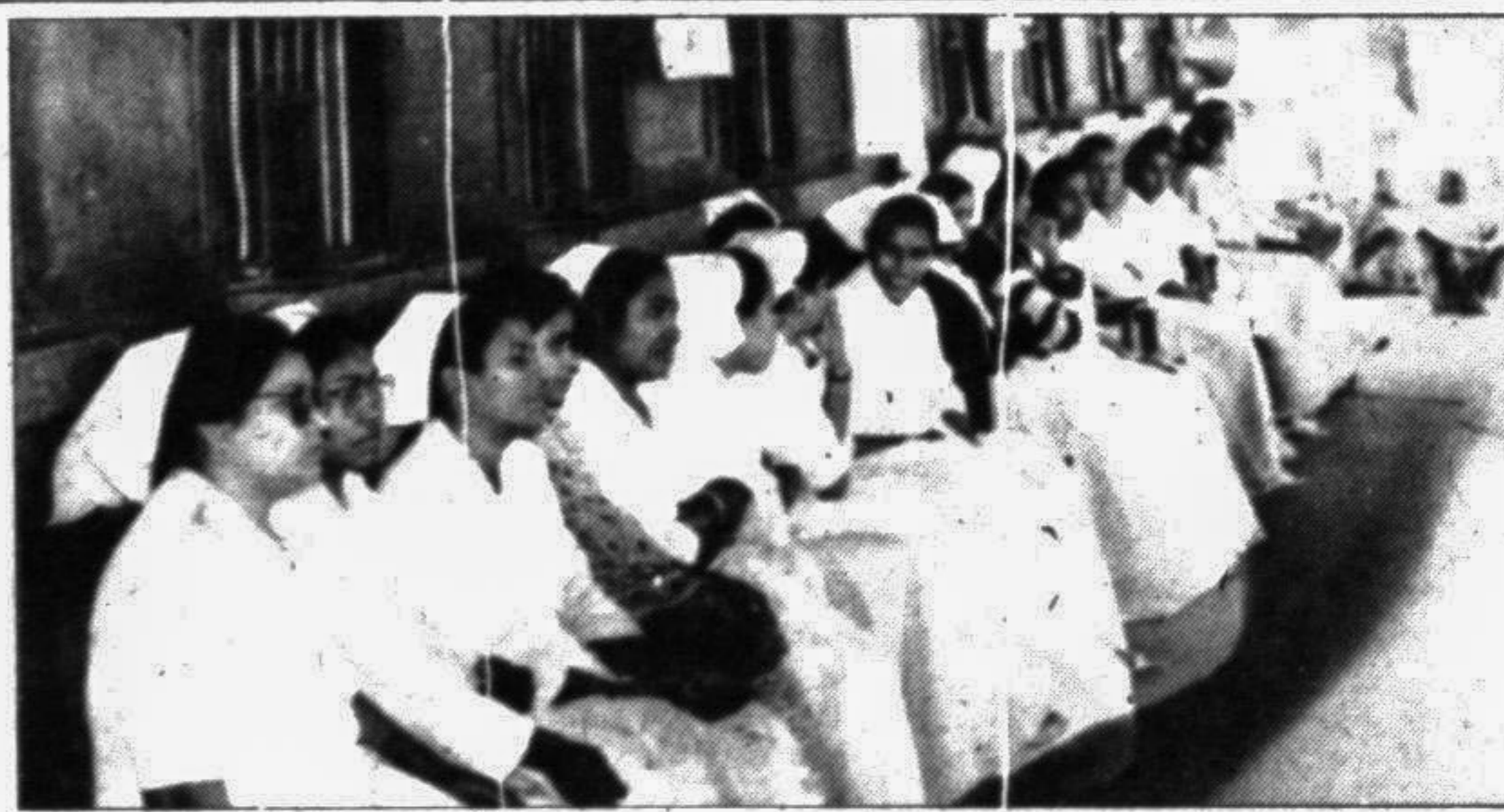
Striking nurses sitting on the corridor of the Out Patients' Department of the Dhaka Medical College Hospital on the first day of their 48-hour countrywide strike yesterday.