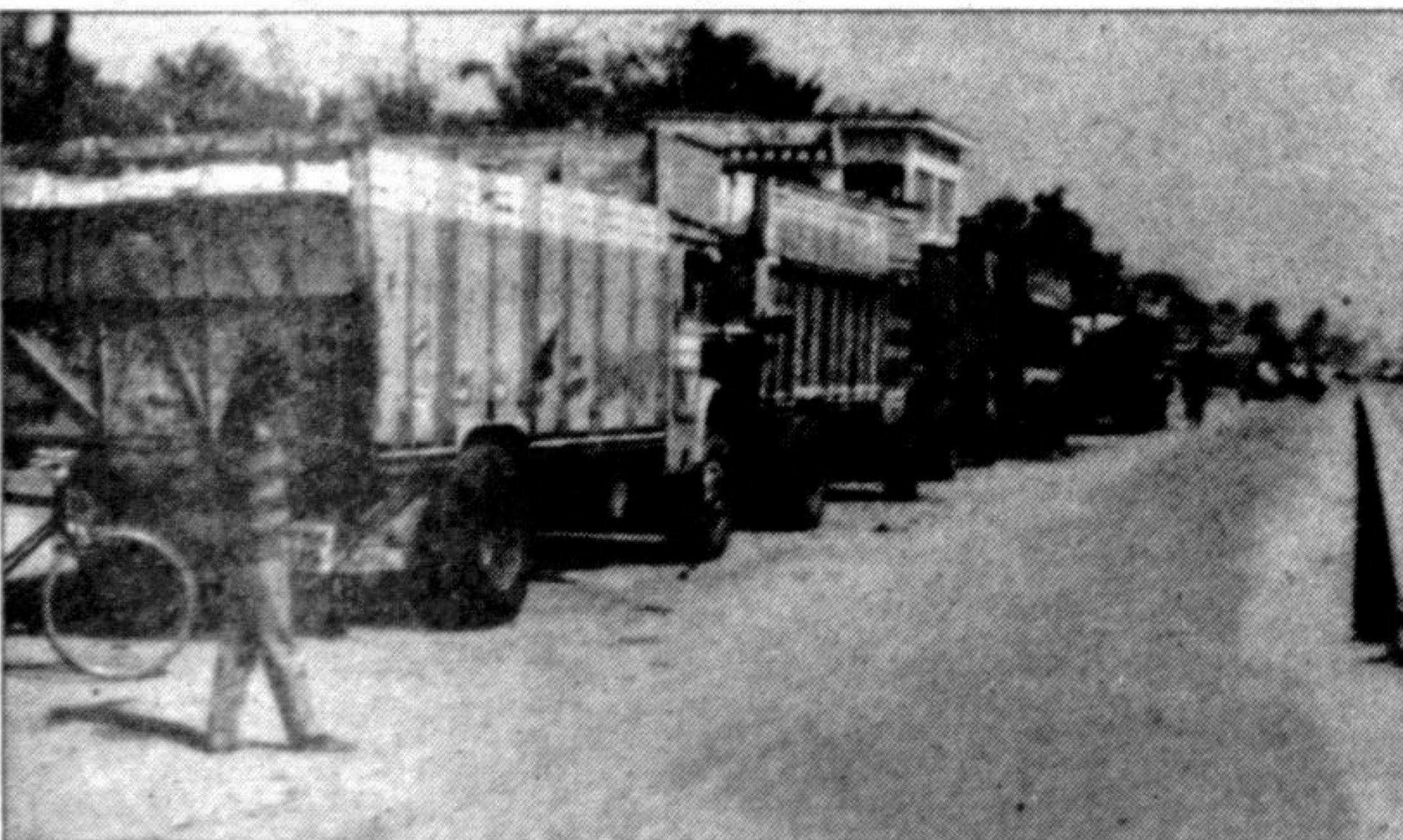
BENAPOLE (Jessor): Trucks loaded with Indian goods are awaiting for clearance at the Benapole customs check post. These trucks remain here for days without any security.