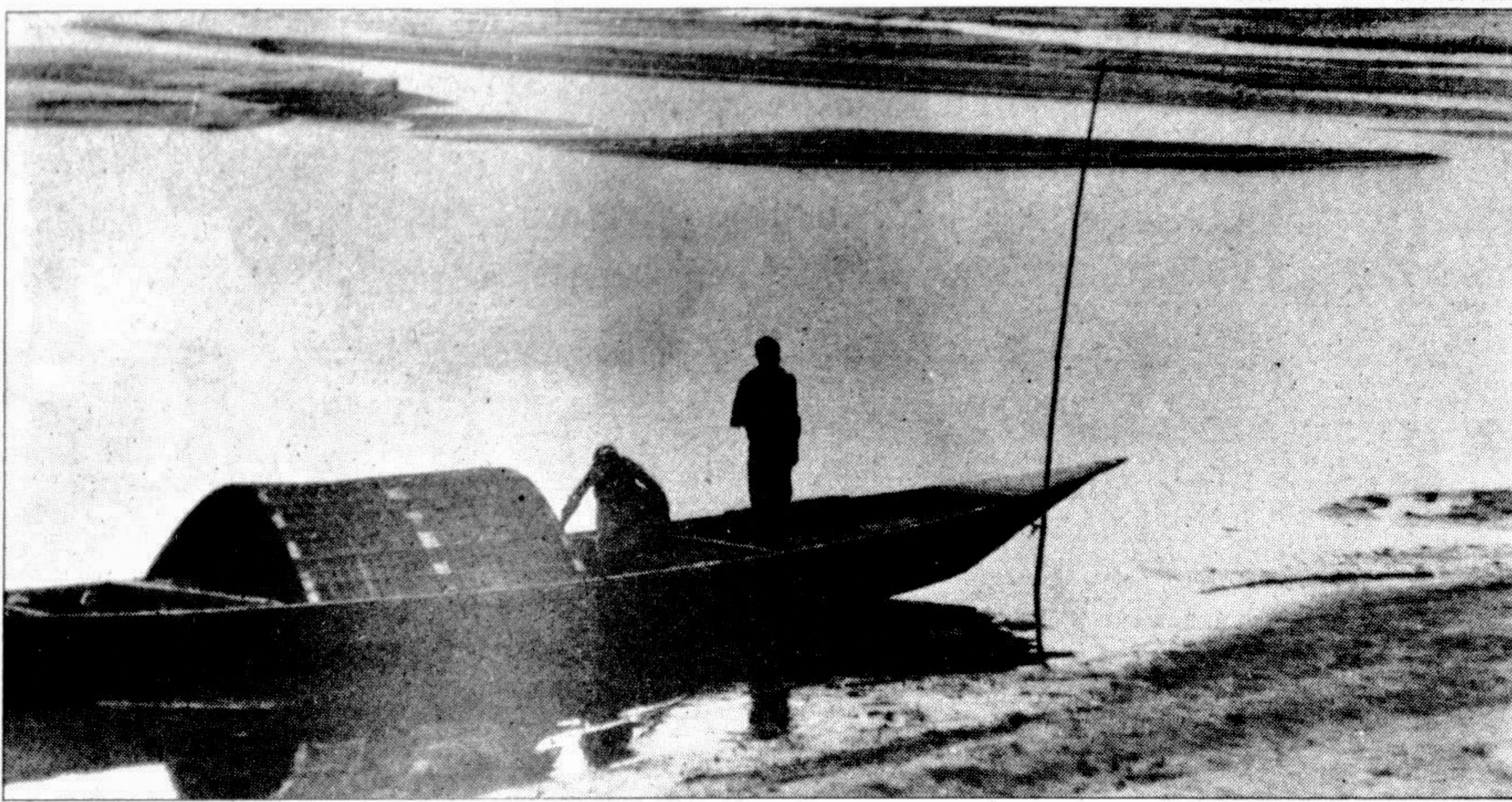
TANGAIL: The rivers of the country have already started to develop shoals (chars) affecting navigational routes. At many place especially in the northern part of the country many river routes had to be relocated one to emergence of charland. The picture shows a huge charland in the middle of river Jamuna near Bhuapur Channel.