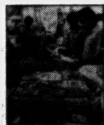
Old Can be Gold Page 3