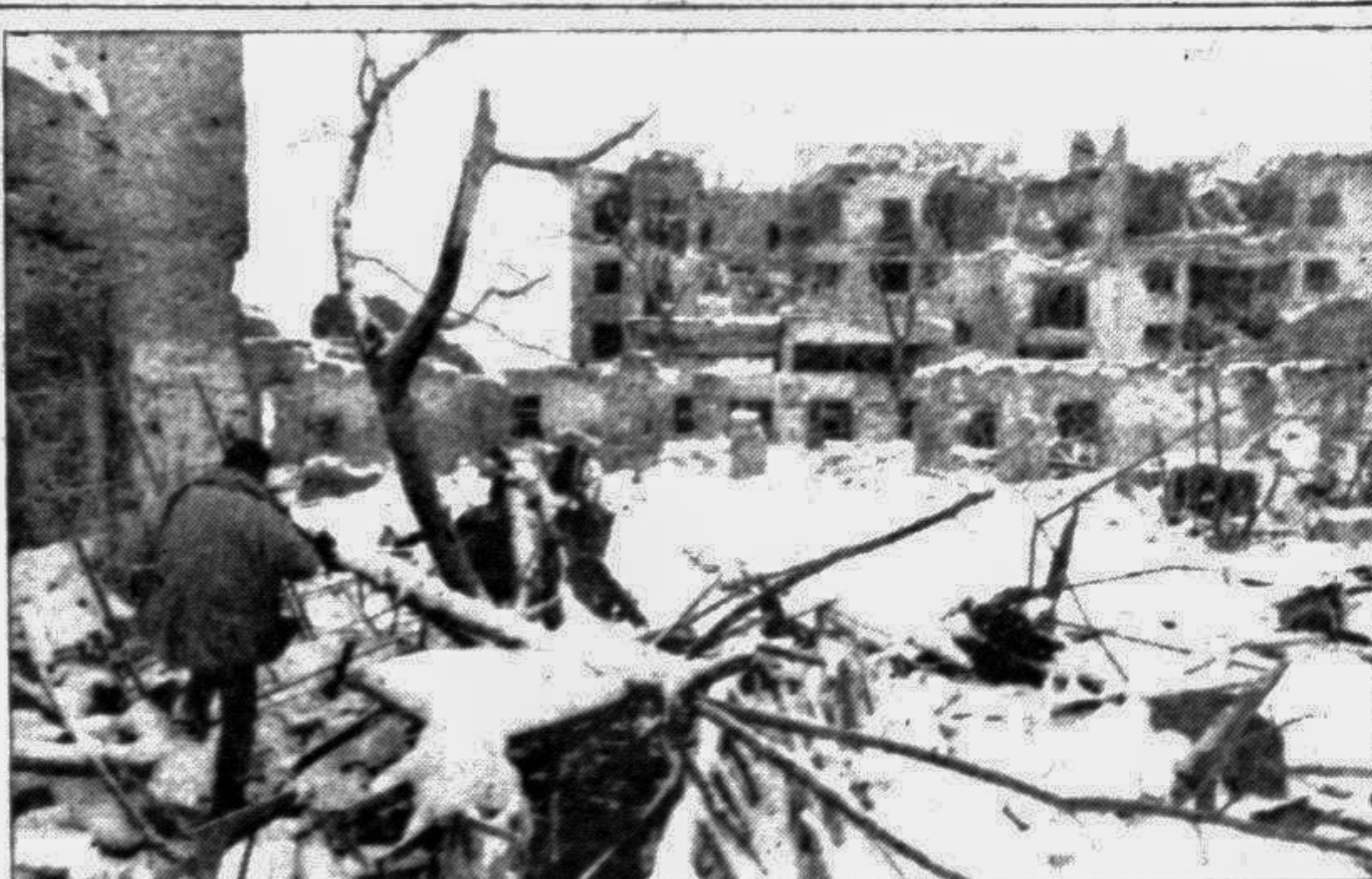
A man walks among the ruins of a district in Grozny yesterday. Only the southeast of the Chechen capital still remains in Chechen hands. There was a relative lull in the fighting yesterday.

Trace rains of less than one millimetre (mm) were recorded in Dhaka, Mymensingh, Faridpur, Madaripur, Jessore, Chuadanga and Rajshahi while 3mm rainfall was reported at Ishwardi, 2mm at Bogra and one millimetre at Tangail yesterday.