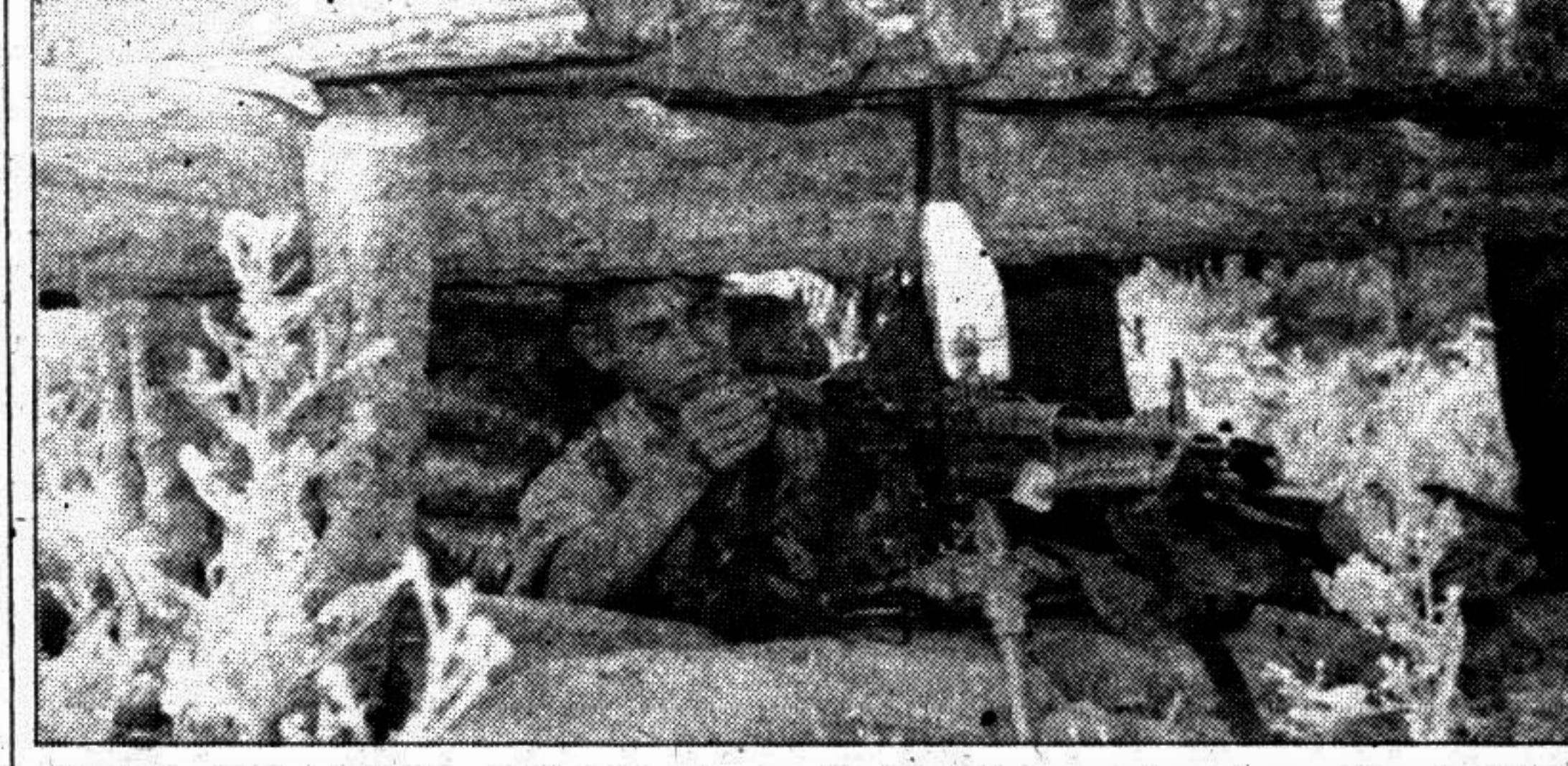
A Thai soldier loads his rifle in a bunker on the Thai-Myanmar border near Kawmoora, 15 km south of Manerplaw Thursday. Security on the border has been intensified since Myanmar soldiers captured the Karen stronghold of Manerplaw January 27 to prevent a spillover of the fighting.

"It is now clear to us that the ruling party plans to keep the Opposition inactive till the next elections by resorting to various tactics," an AL leader said adding, "The policy of