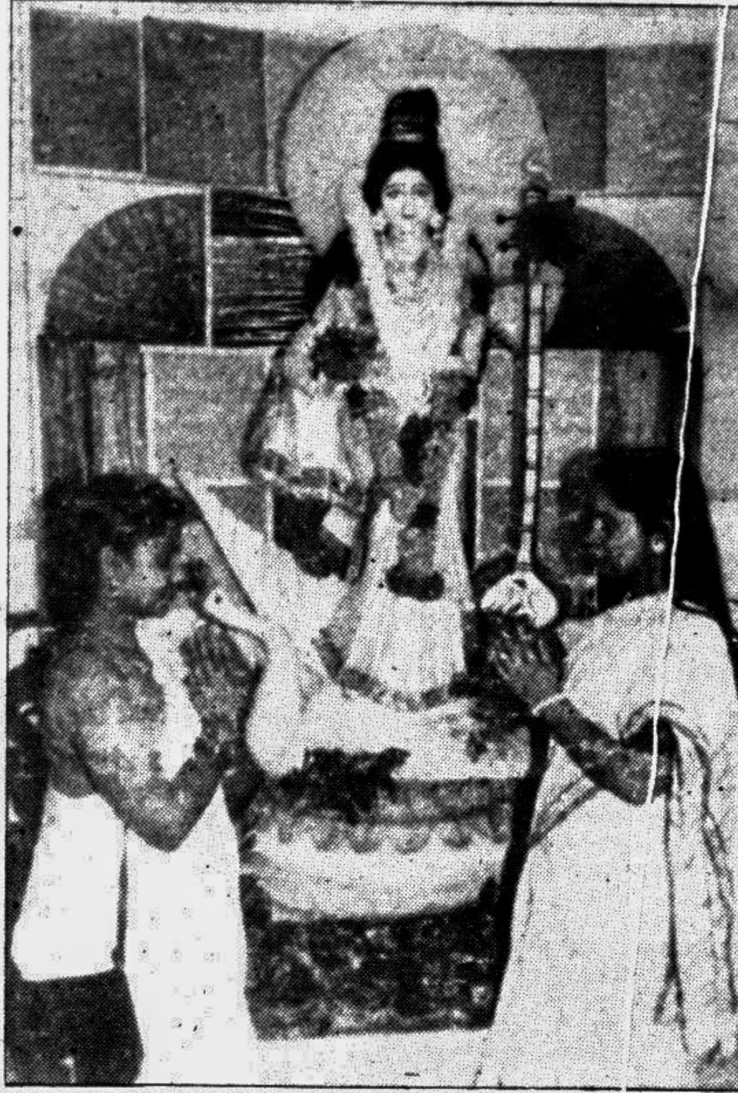
Devotees offering anjali to goddess Saraswati at a puja mandap at the Rokeya Hall of the Dhaka University yesterday.

The academy will hold discussion on 'Bangla Academy Bengali-English Dictionary' today.