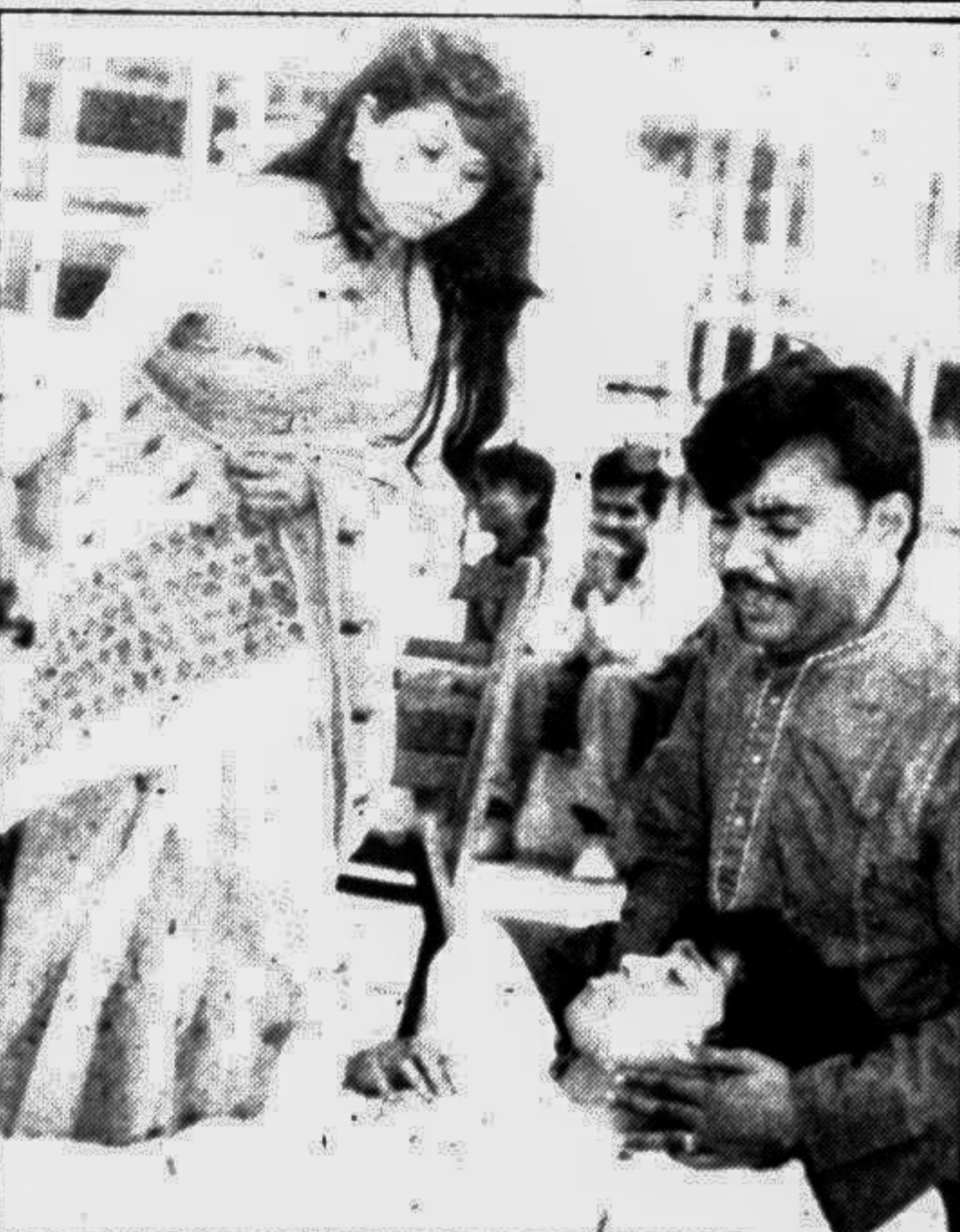
The Montreal Natya Sampradaya staged the play 'Prostab' at the central Shaheed Minar in the city yesterday.