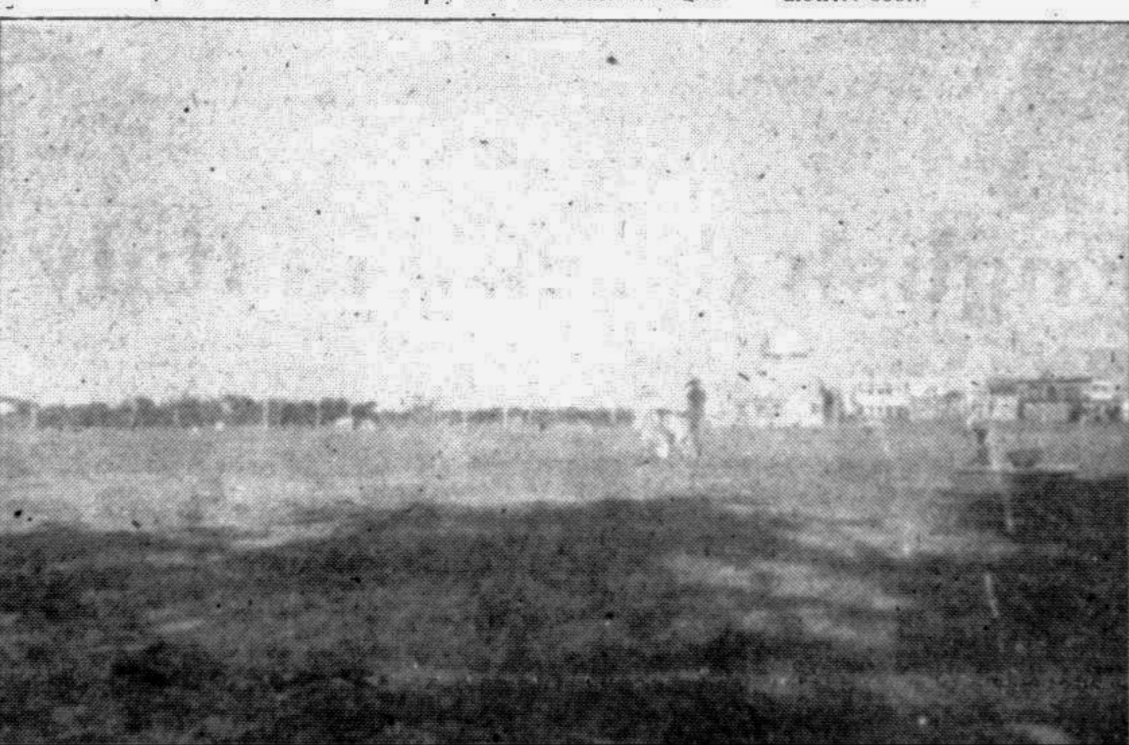
BRAHMANBARIA: At least 100 plots of BSCIC industrial estate remain empty for more than eight years. In 1987 the industrial estate of 124 plots were established on 21.98 acres of land at Nandanpur, some 7 Km from the B'baria town.

The Kutchra road from Katiadi bazar to Char Noakandi is in dilapidated condition and not even fit for rickshaws and bullock carts.