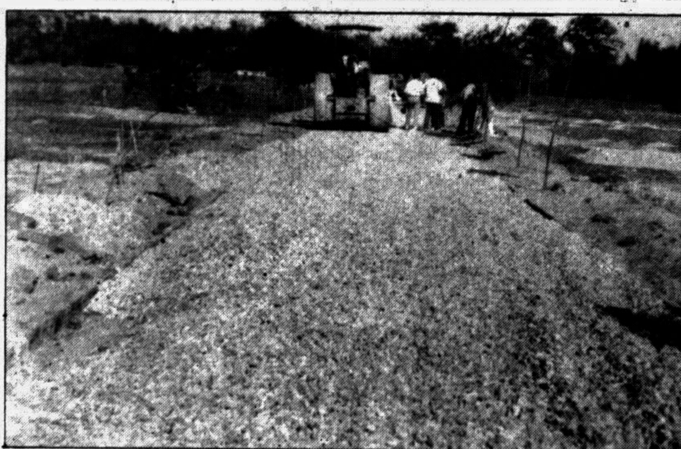
RANGPUR: A vital road at Dahagram-Angorpota enclave linking the Tin-Bigha Corridor is under construction. The total cost of the work is estimated at Tk 17 lakh.

The brick soling road are yet to be completed. On the other hand, the tank of industrial estate which was dug inside the estate at the beginning was not used for pisciculture neither leased to any party. Sources have said, if 124 plots of industrial estate were run to produce six thousand unemployed youngsters it would get a good opportunity for providing themselves in the job. The people have urged the authority to apply easy process and take proper step for dissolving the all kind of difficulties of the BSCIC industrial estate of Brahmanbaria district soon.