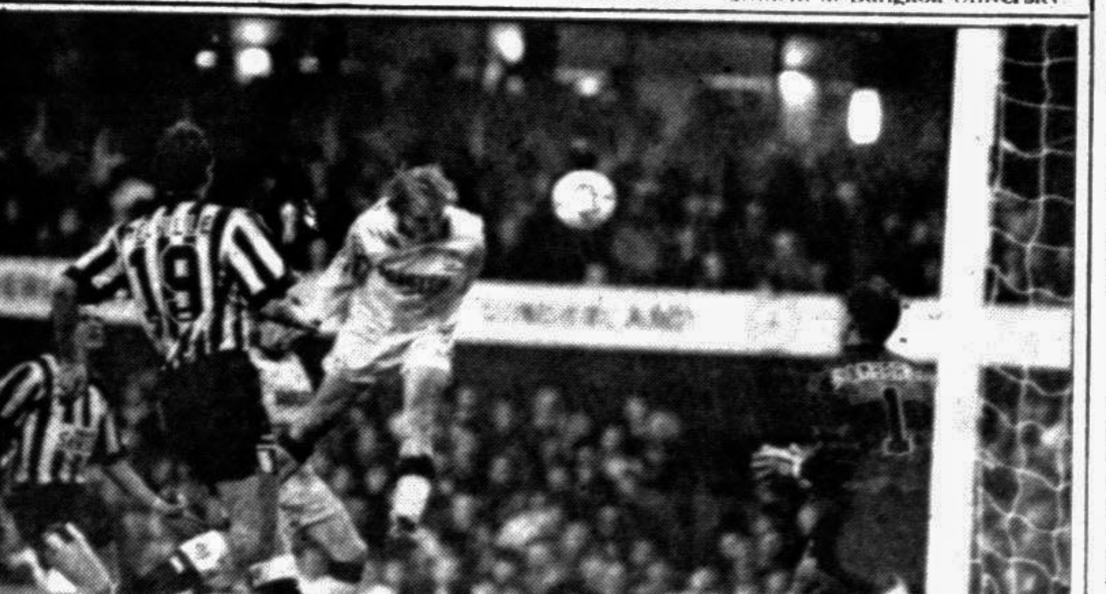
Tottenham Hotspur's German international Juergen Klinsmann (C) catches Sunderland keeper Alec Chamberlain off his line to add score his second goal in Spurs 4-1 FA Cup win in Sunderland on Jan 29.

Today's Cryptoquip clue: A equals F The Cryptoquip is a substitution cipher in which one letter stands for another. If you think that X equals O, it will equal O throughout the puzzle. Single letters, short words and words using an apostrophe give you clues to locating vowels. Solution is by trial and error.