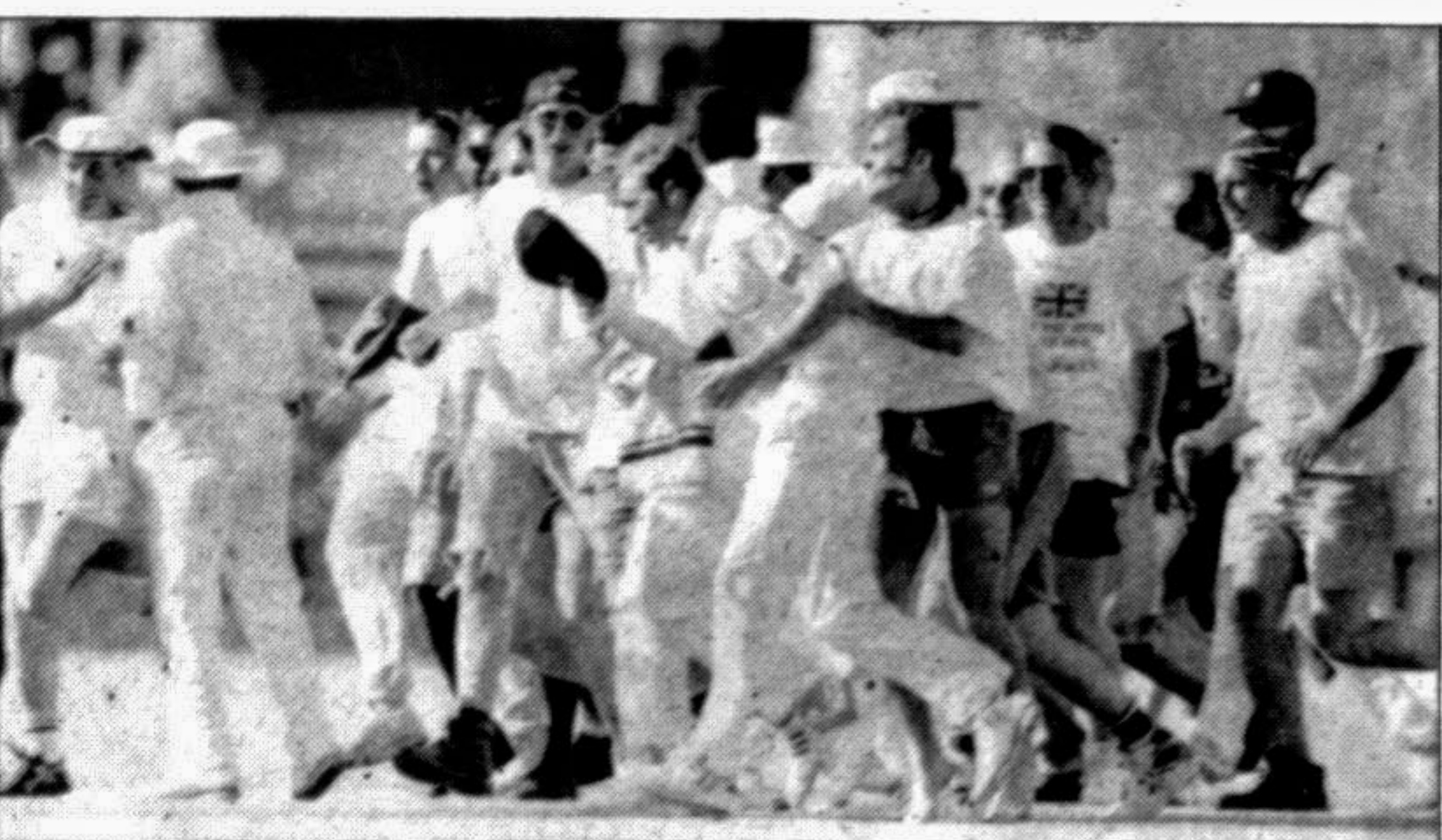
England skipper Michael Atherton (C) runs off the field surrounded by Barmy Army fans after England won the fourth Test against Australia in Adelaide yesterday. It was England's first Ashes Test win at Adelaide Oval in 16 years and their first Down Under in eight years.

CALCUTTA, Jan 30: Mohun Bagan was today officially declared the 1994 Calcutta Super Division league champions after the Calcutta High Court rejected all the pending petitions and allowed Indian Football Association (IFA) to make the official announcement, reports PTI. The West Indies made 450 for nine and then reduced Otago to 173 for five in their first innings. Wicketkeeper Murray and all-rounder Cummins came together with the tourists at 222 for seven late Sunday and took the tourists through to 295 by the close. The pair scored rapidly Monday — adding 142 runs in just under two hours before Cummins (107) pulled a ball from spinner Paul Wiseman straight to square leg. He resumed at 29 and hit 12 fours and a six in his three-hour, 20 minute stay at the crease. Murray didn't offer a chance as he reached 141 not out. He was at the crease for just over six hours and hit 15 fours and two sixes — both off Wiseman which landed on the roof of the main stand. The pair brought up their century partnership in 136 minutes but the second hundred took just under an hour. Both Windies wickets fell in the same over, with Wiseman getting Kenneth Benjamin lbw for nought. Kenneth Benjamin claimed two for 42.