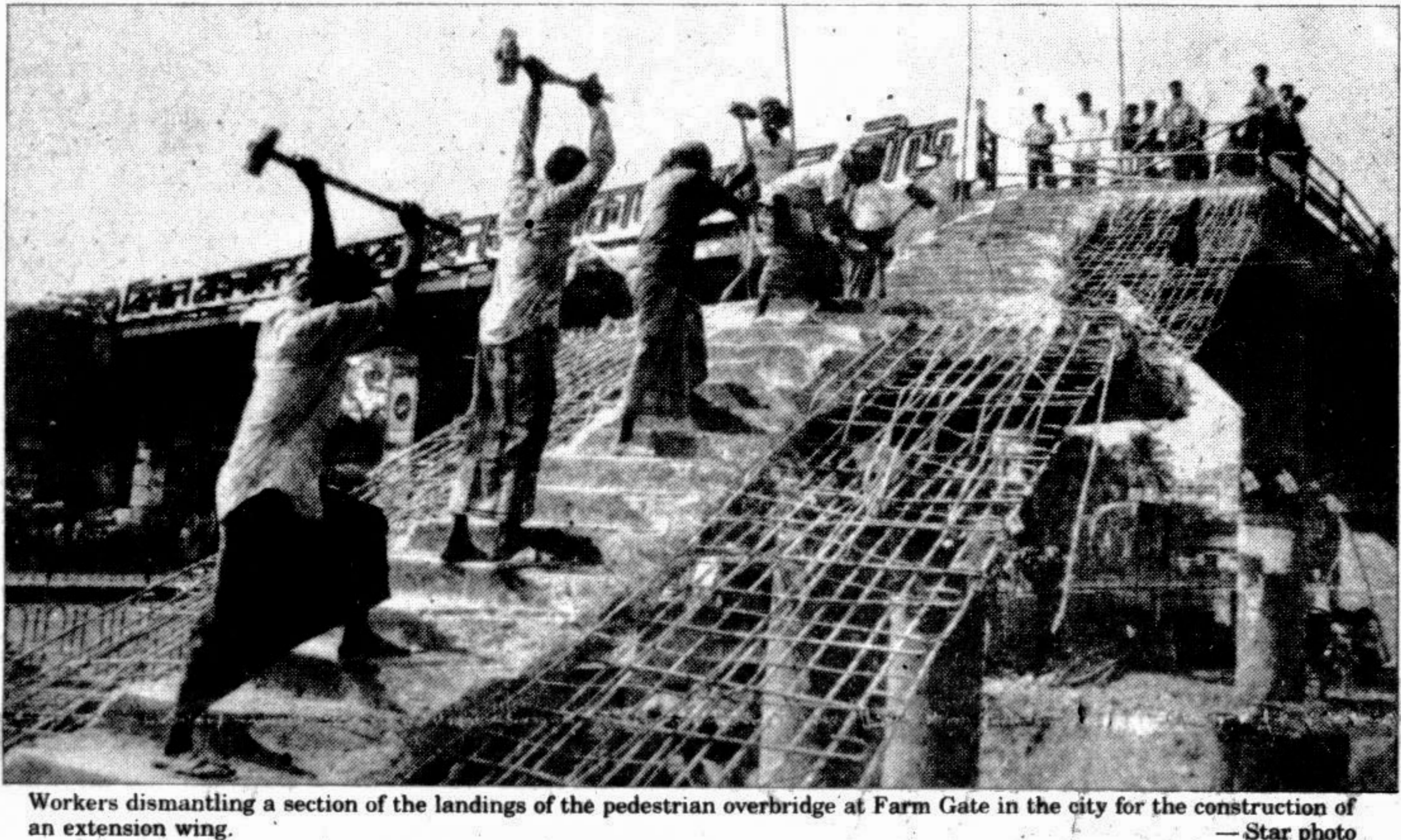
Workers dismantling a section of the landings of the pedestrian overbridge at Farm Gate in the city for the construction of an extension wing.