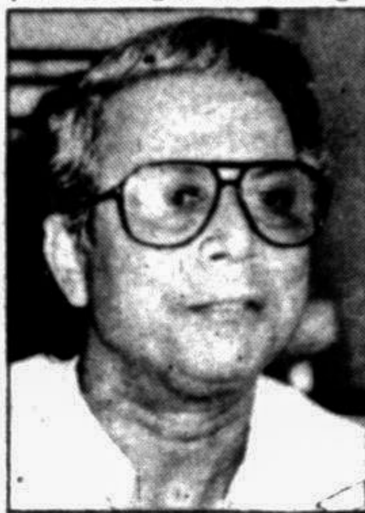
Prof Md Yunus

bank. It is a social movement. Customers must promise to keep their children in school, not drink polluted water, not give dowries when their daughters marry nor take them when their sons marry, plant trees, grow and eat veg-