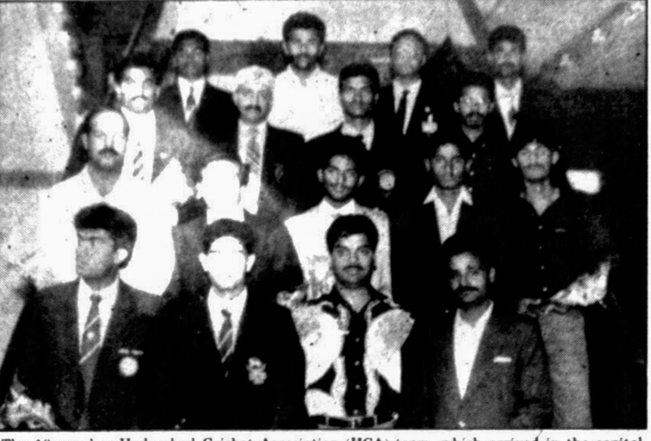
The 16-member Hyderabad Cricket Association (HCA) team, which arrived in the capital yesterday to play a number of exhibition matches against local selections. The South Indian cricketers went straight to Comilla from the airport to prepare for today's limited over match against Bangladesh A.

DUNEDIN, New Zealand, Jan 29: Three players suspended for drug use on the recent cricket tour of South Africa, have been recalled to the New Zealand Test team to play the West Indies in Christchurch, reports AP.