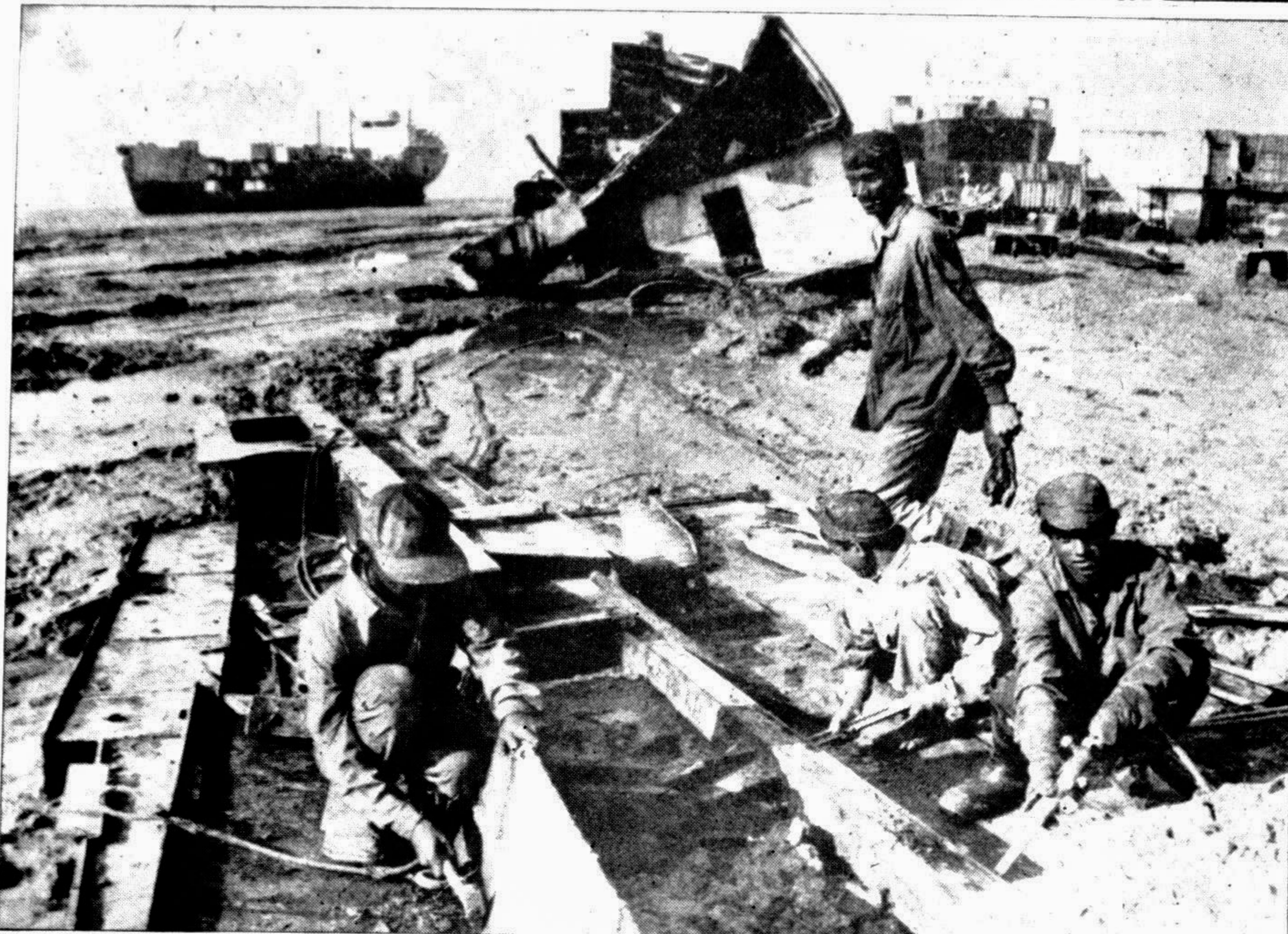
CHITTAGONG: These men are involved in ship-breaking work. Foreign ships are dismantled here at the Chittagong Port. Many of the workers received serious burn injuries during the work in the past.