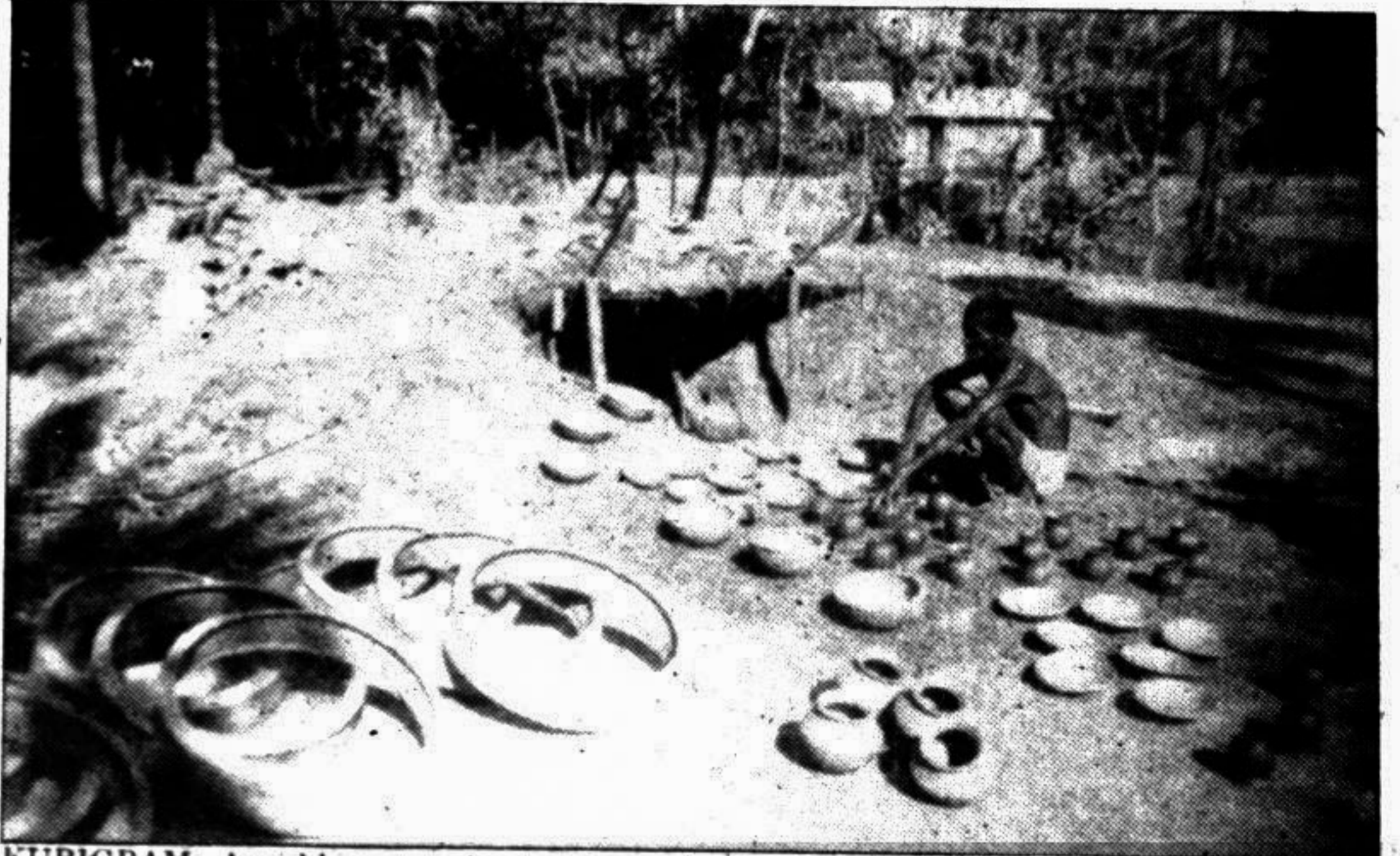
KURIGRAM: An old man, who has been involved in pottery business for more than 25 years, is seen readying pottery products for oven burning. The products are still in demand in the local markets but few years ago there was great demand of pottery products outside the district.

The condition of their residential areas is very poor and unhygienic. While visiting some of the areas in Kumarpas this correspondent found the craftsmen in action making tiles. Sadly their own house roofs were made up of bamboos, and palm leaves. There is acute scarcity of drinking water in those localities though they make rings slabs for sanitary latrines for marketing.