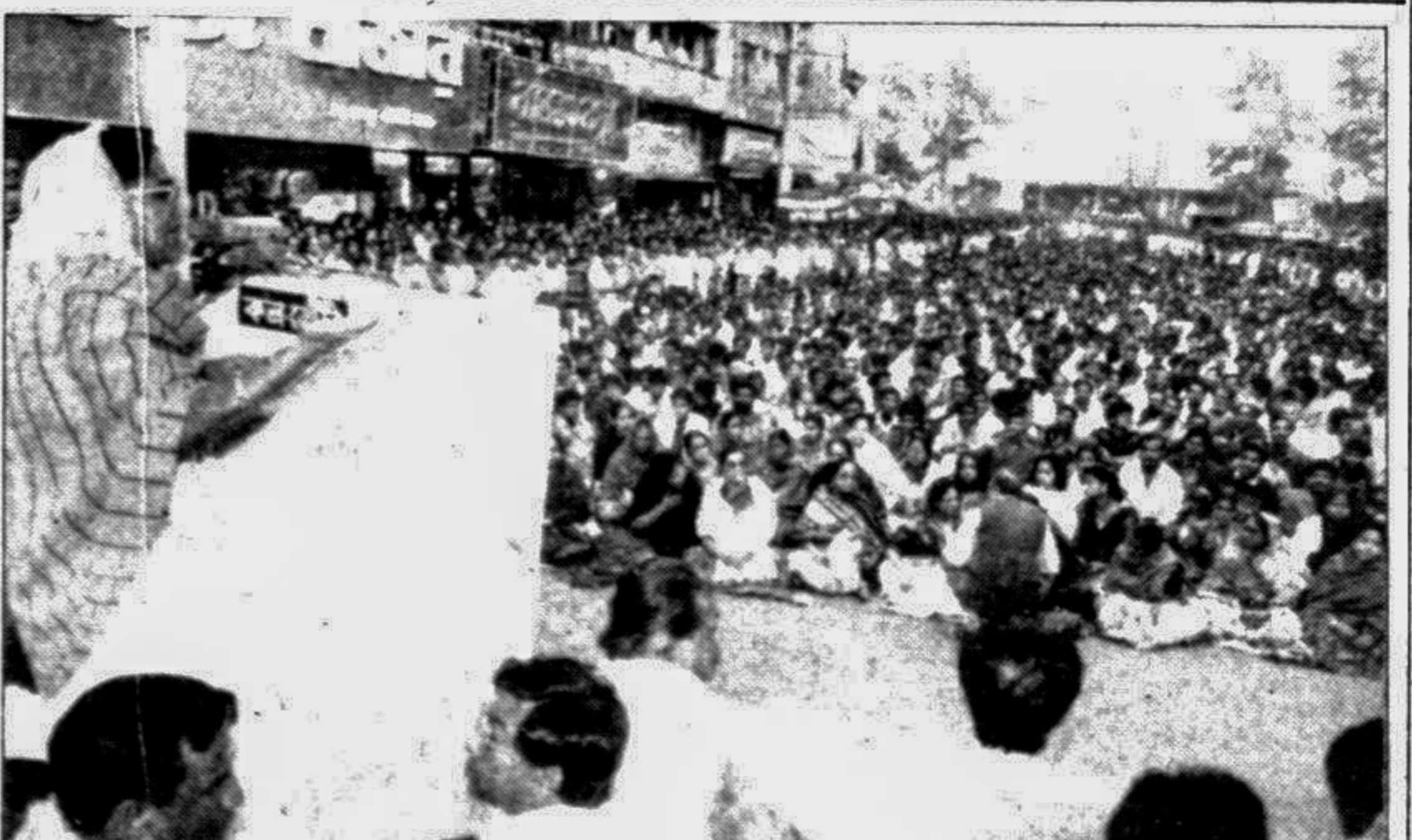
Awami League chief Sheikh Hasina addressed a rally at Bangabandhu Avenue in city yesterday.