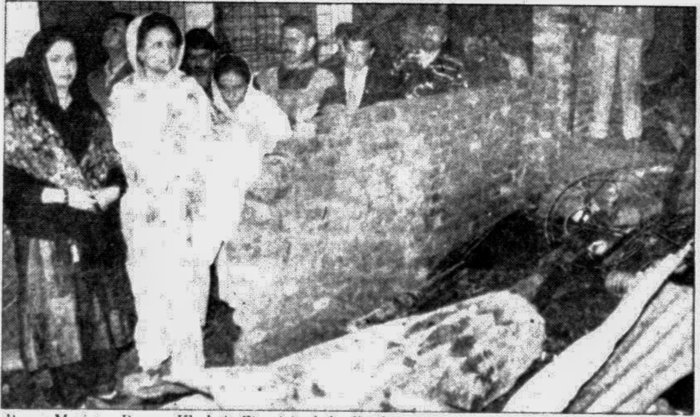
Prime Minister Begum Khaleda Zia visited the Ibrahimpur area in the capital Saturday night soon after a big fire destroyed many slums, killing at least two persons and leaving thousands homeless.

James P Grant dead UNITED NATIONS, Jan 29: James P Grant, the crusading director of UNICEF who won the Presidential Medal of Freedom for his efforts to improve children's health around the world, died on Saturday, two days after resigning for