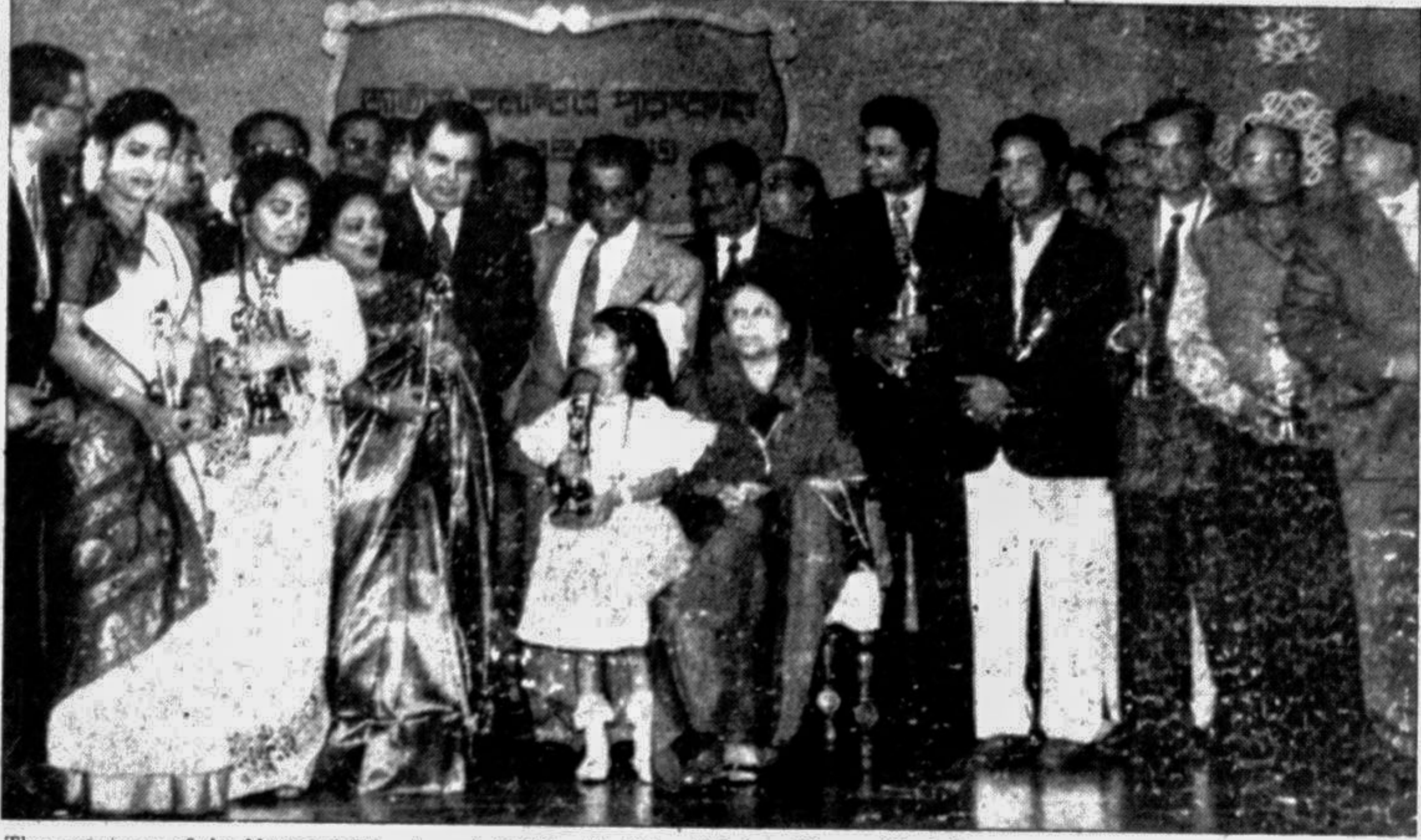
The recipients of the National Film Award 92-93 with Prime Minister Begum Khaleda Zia at the city's Osmany Memorial Auditorium yesterday. The living legend of the film world of the subcontinent Dilip Kumar also seen in the picture.