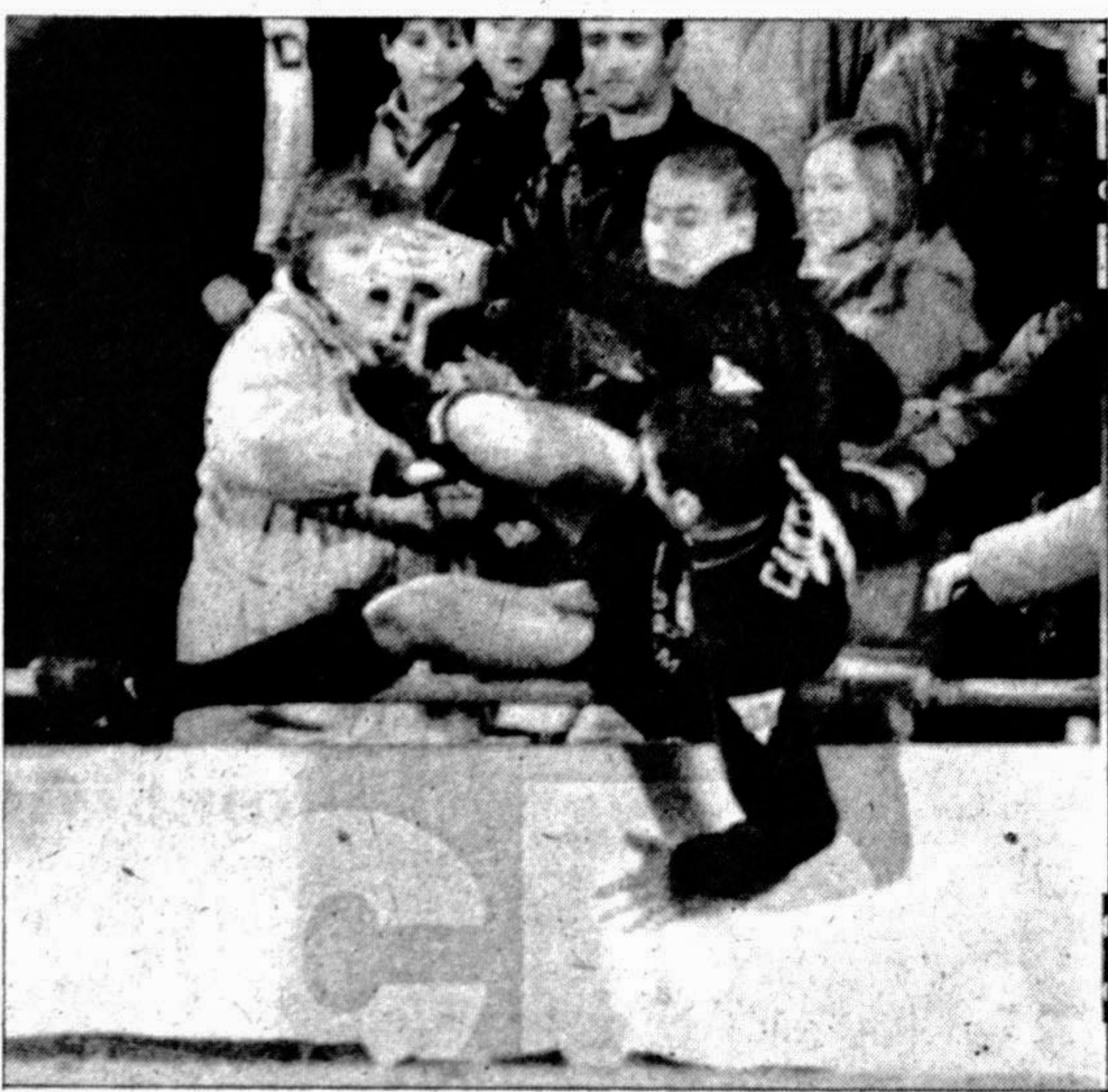
FLYING FRENCHMAN: Manchester United's volatile but flamboyant midfielder Eric Cantona launches himself at a spectator Bruce Lee style during United's English Premiership match against Crystal Palace at Selhurst Park in London on Jan 25. Cantona was reacting to a taunt on walking back to the dressing after receiving his marching orders. The game ended 1-1.