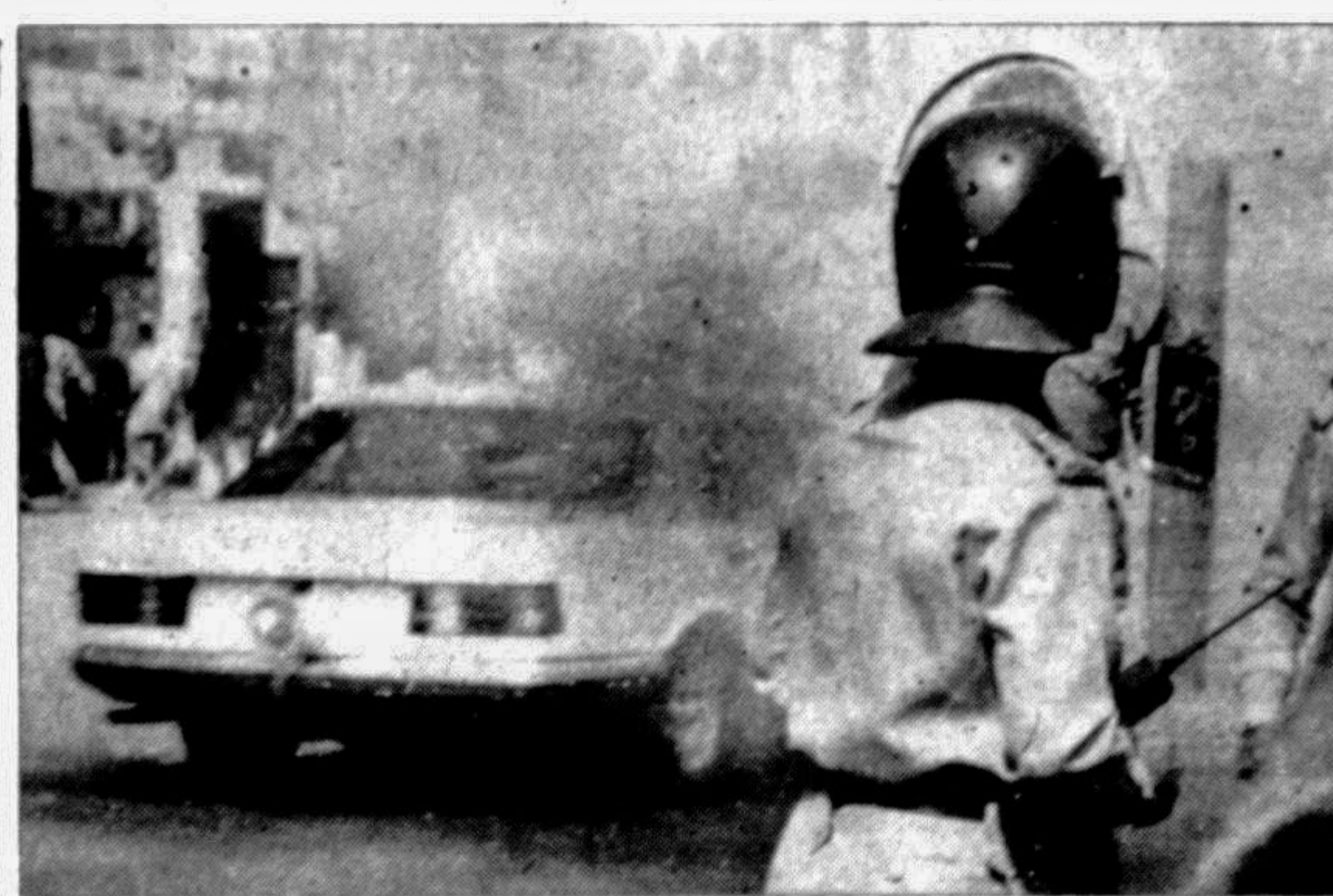
Smoke from a hand bomb, allegedly hurled by Opposition activists enforcing yesterday's half-day hartal in the city, which exploded in front of the Awlad Hossain Market near Farm Gate as Prime Minister Begum Khaleda Zia's motorcade was passing through in the morning.

"Yet in this situation we are being asked to give back to Russian mothers their cap-