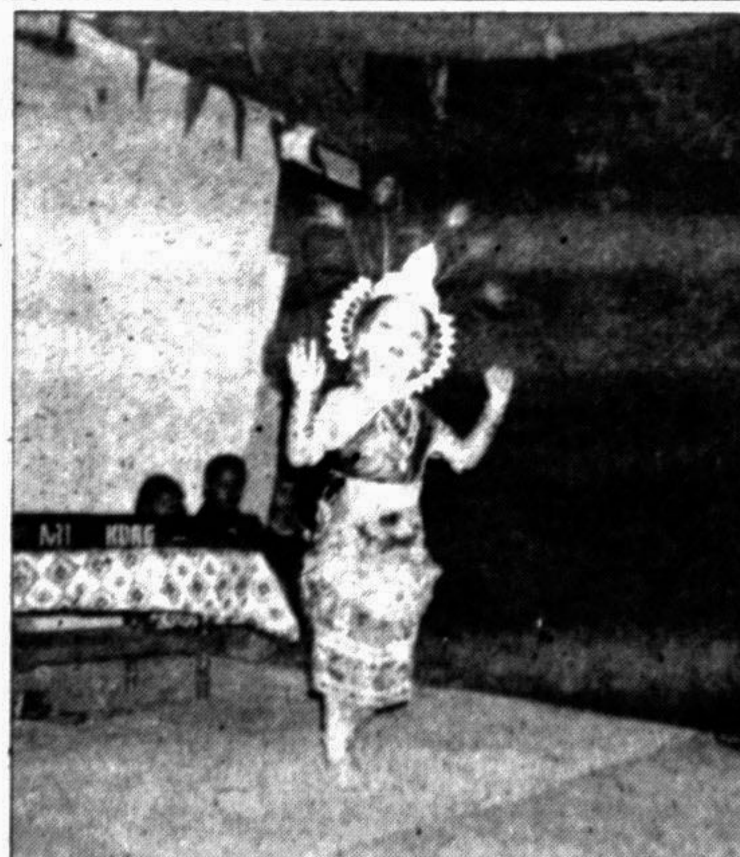
CHANDPUR A seven year old child performing a dance recently at the annual cultural function at the district police line.

The only hostel of Satkhira Government College can hardly accommodate 50 students where as the minimum demand for seats is not less than 400. The Satkhira government women college has also a hostel which accommodate only 40 students whereas the minimum demand for seats more than 200. The college is not able to provide accommodation to the lady teachers. The guardians of the students of these two institutions urged the concerned authorities to expand this two hostels for catering the needs of acute house problem. There is no other hostel for the students of 4 other colleges of the town. The PN High School has a hostel only in name. It can hardly accommodate 10 students whereas the number of students on its rolls is about 800. The Government High has no hostel.