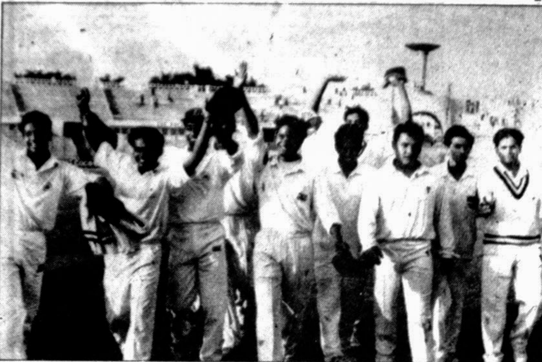
Jubilant Bangladesh under-19 players return to the pavilion after beating the visiting Kenyan national squad...