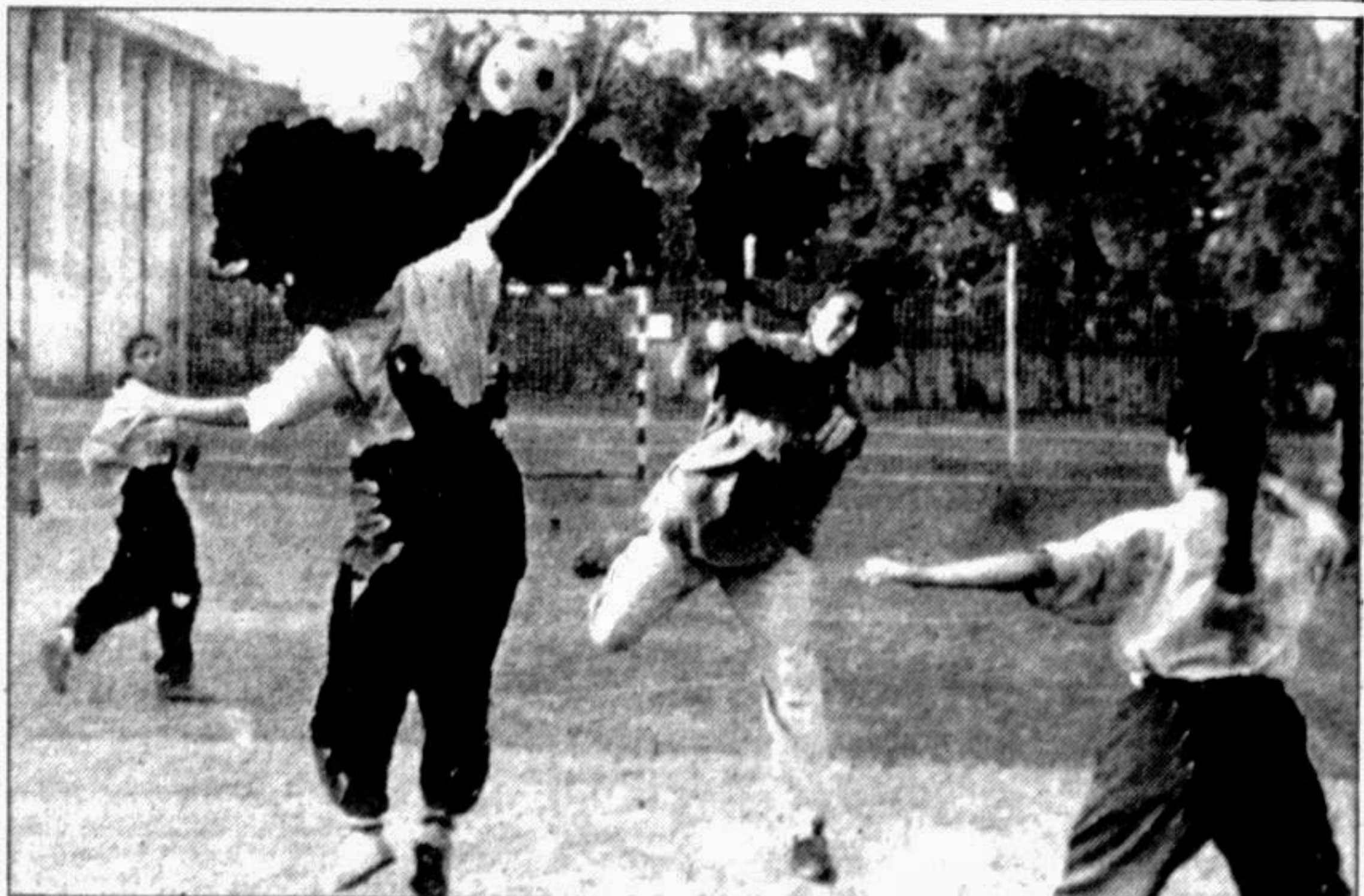
Action from yesterday's Delta Life inter-college and hall women's handball championship match between Viquarunnisa Noon College and Sher-e-Bangla Girls' College at the National Women's Complex. Viquarunnisa won the match 11-1.

But with Neil Fairbrother hopeful of being fit for the Test after a shoulder injury and Mike Gatting also in the squad, it appears unlikely at this stage.