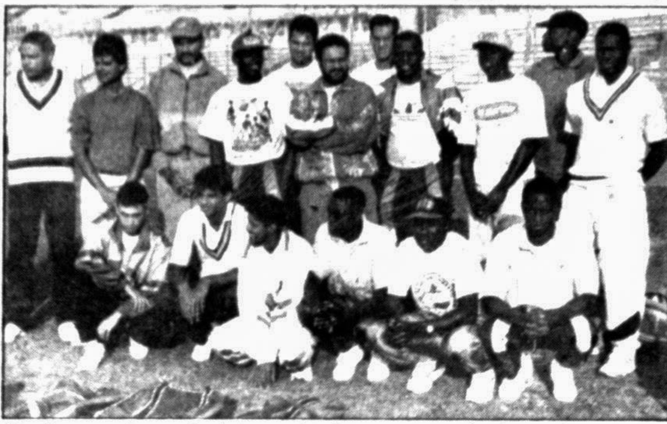
The Kenyan cricket squad, which arrived in the morning, gave the photographer a moment during their net practice at the Dhaka Stadium yesterday.

Eden College beat Anwara Begum Muslim College 5-1. Fajilatunnisa Hall humiliated Arambagh Girls' College 13-1 while Viquarunnisa Noon College sailed to a 11-1 win over Sher-e-Bangla Girls' College.