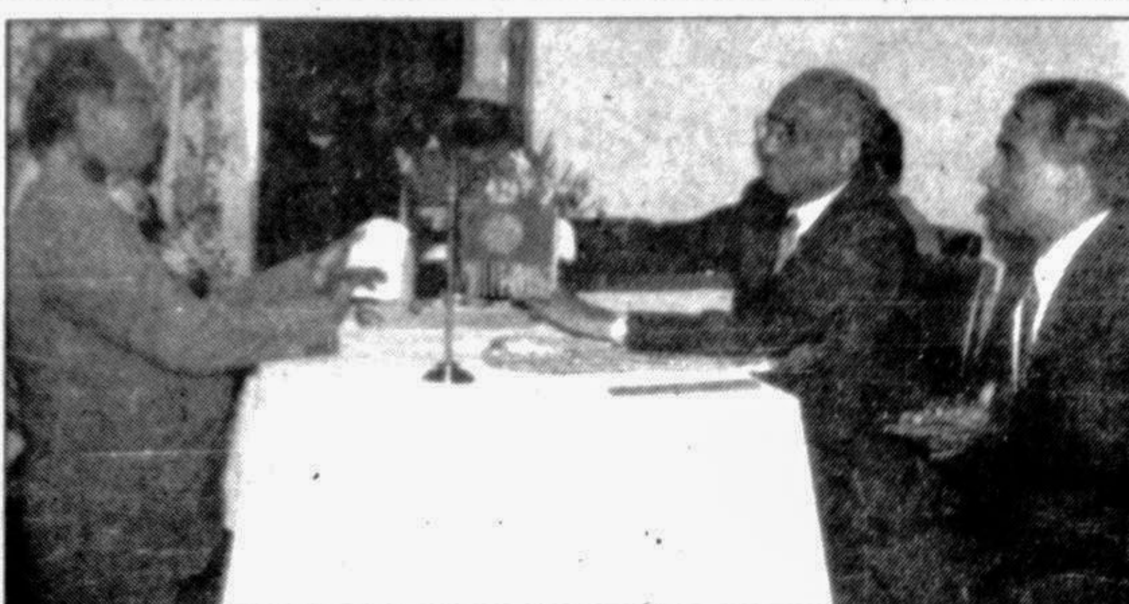
MOULVIBAZAR Finance Minister, M Saifur Rahman handing over a cheque of Taka 50,000 to Shafiqul Wahed, President of Moulvibazar Press Club recently for development of the club building.

They also established three nuskhas, libraries in different places of the district.