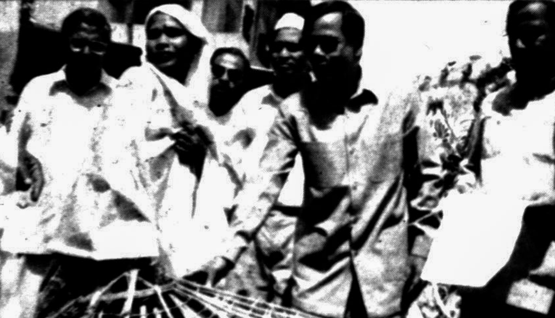
BRAHMANBARIA: The Islamic Foundation of the district unit recently arranged to distribute hens among the distress women of the district. The Deputy Commissioner, Md Abdul Matin, of the district distributing a cage of hens to a woman.

The fishermen said, fish cultivation has been rendered virtually impossible during the dry season as extra water is not coming down from the hilly areas.