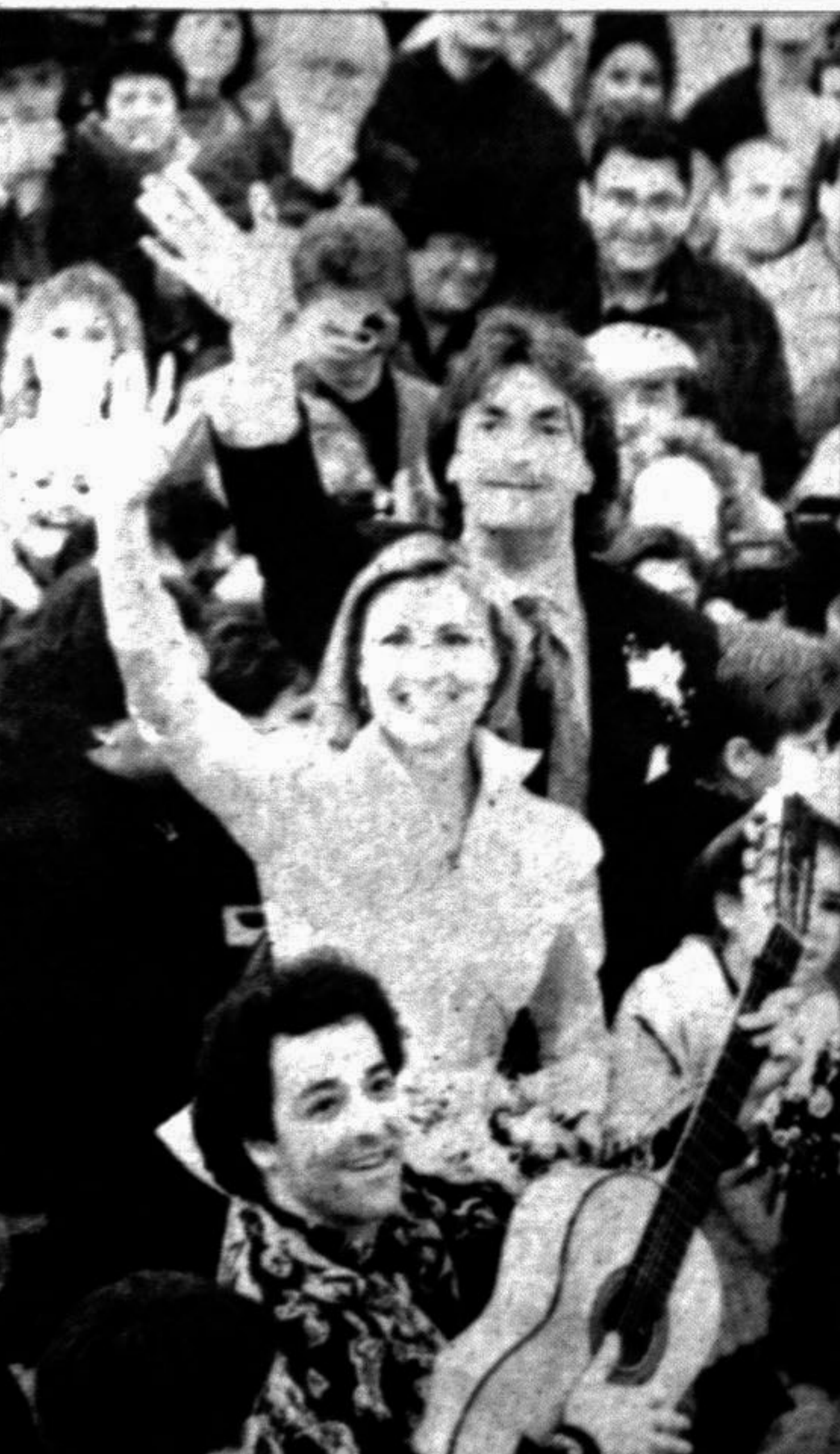
French tennis ace Henri Leconte and his bride, bullfighter Marie Sara, wave to a cheering crowd during their wedding in Saintes-Maries-de-la-Mer, southern France on Jan 20.

Henri Leconte, hugely popular in France and beyond for his swashbuckling tennis and for helping the national team to victory in the 1991 Davis Cup, said: "The Davis Cup was great but this marriage is even better."