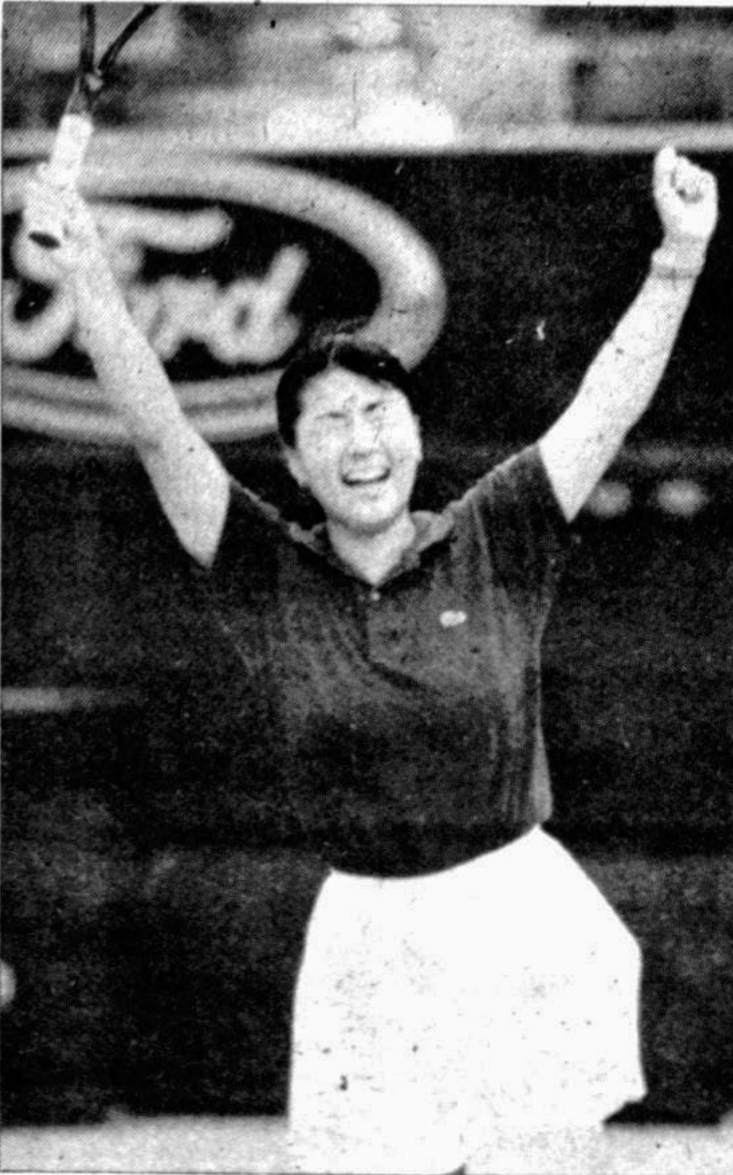
Naoko Sawamatsu of Japan celebrates her win over compatriot Kimiko Date at the Australian Open in Melbourne yesterday. Sawamatsu won 3-6, 6-3, 6-3.

With Ondruska serving at 40-30, the linesman ruled a shot by Rafter wide. But International Tennis Federa-