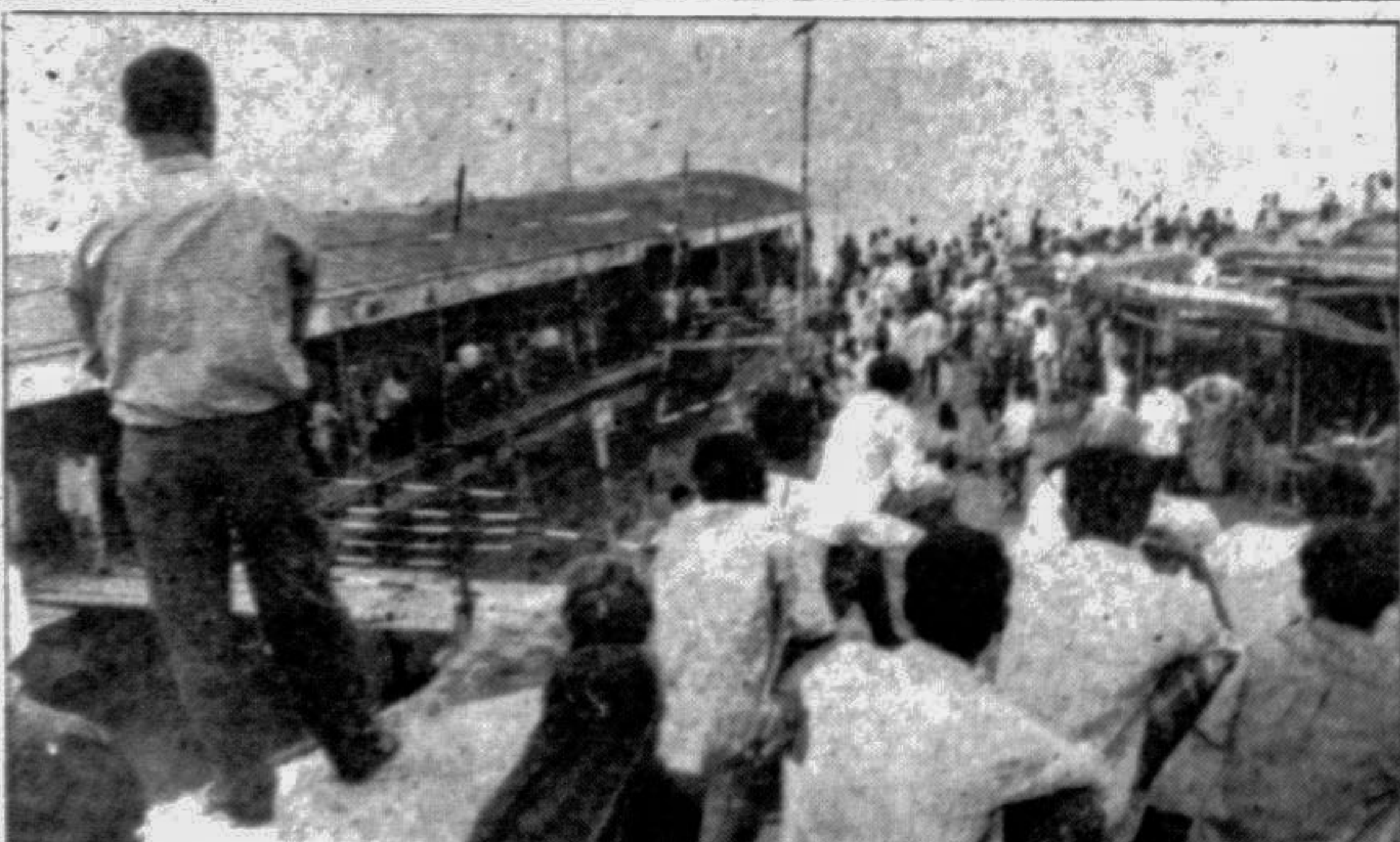
Passengers eagerly await the arrival of Bangladesh Railway steamer at the Bahadurabad Ghat in Jamalpur. The so-called ferry service, between Bahadurabad Ghat and Phulchhari Ghat in Gaibandha on the opposite side of the river Jamuna, is almost always uncertain causing untold inconvenience to hundreds of train passengers.

Wherever BR stands today, it enjoys the most sophisticated telecommunication system in the country. An Optical Fibre telephone system has been set up recently connecting every nook and corner of BR network on a fingertip. Costing Tk 120 crore and in- See Page 12 Col 3