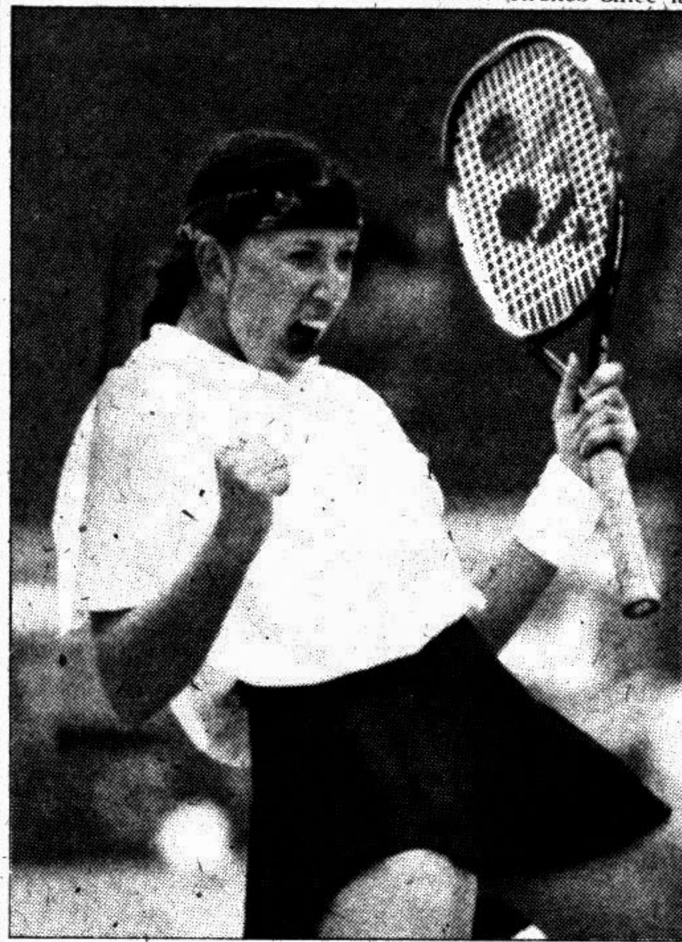
Natalia Zvereva of Belarus jubilates after beating Austrian Judith Wiesner at the Australian Open in Melbourne yesterday. Zvereva won 4-6, 7-6 (7-3), 6-4.