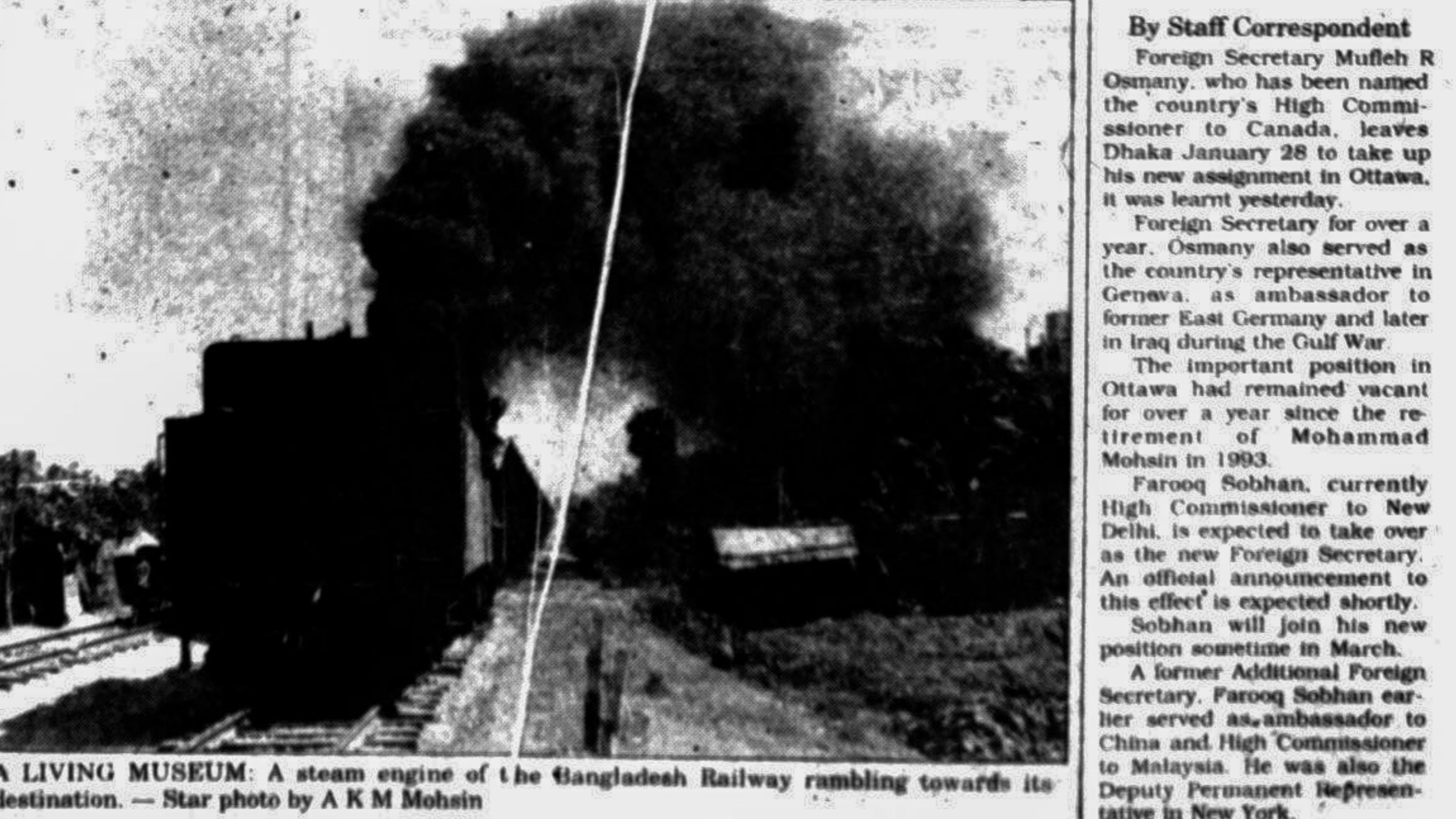
A LIVING MUSEUM: A steam engine of the Bangladesh Railway rambling towards its destination.