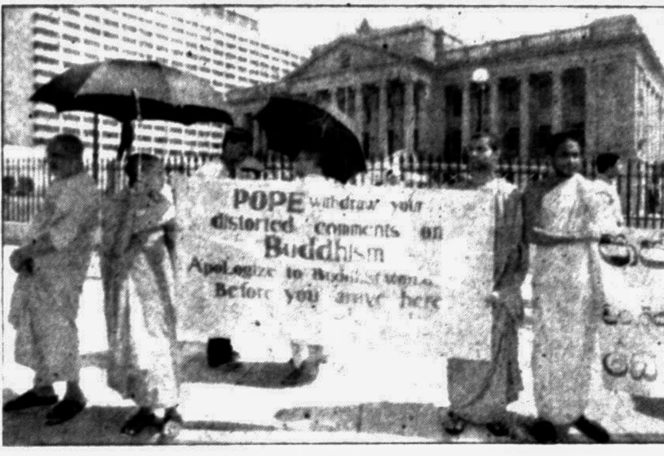
Buddhist monks gather outside the Presidential Secretariat yesterday in Colombo to protest Pope John Paul II's recent remarks critical of the Buddhist faith. About 100 monks took part in the peaceful protest, one day ahead of the Pope's arrival in predominantly Buddhist Sri Lanka.