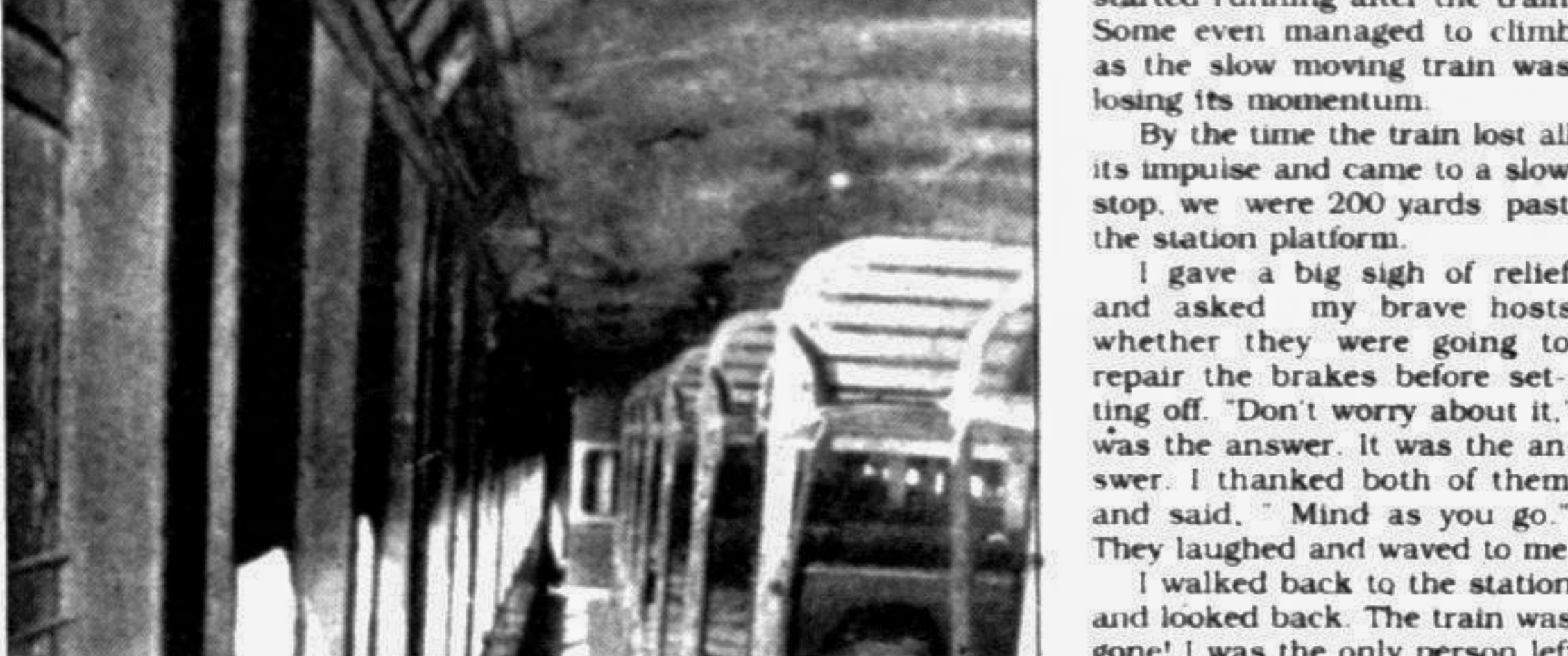
Inside a passenger compartment of a Bangladesh Railway train.

I felt a cold sweat over me. The smoke was quite intense. The drivers continued their gossip with mouthfuls of 'Pan'. They didn't look the least bothered about the fuming situation. By now we were crossing the Mahakkhal crossing where a huge afternoon traffic was held up to let us pass. "Another few minutes and I am there," I whispered to myself. As we approached Banani Station, I could see the waiting mass moving toward the platform. In the engine room the driver pulled the brake lever. The train refused to stop. The drivers looked at each other and pulled again. The carriages rolled on and on. "The brakes are gone," said one of them without the slightest concern. The crowd at the station started running after the train. Some even managed to climb as the slow moving train was losing its momentum. By the time the train lost all its impetus and came to a slow stop, we were 200 yards past the station platform. I gave a big sigh of relief and asked my brave hosts whether they were going to repair the brakes before setting off. "Don't worry about it," was the answer. It was the answer. I thanked both of them and said, "Mind as you go." They laughed and waved to me. I walked back to the station and looked back. The train was gone! I was the only person left on the small station. I lit a cigarette and walked across the airport road. This time I took a bus back home.