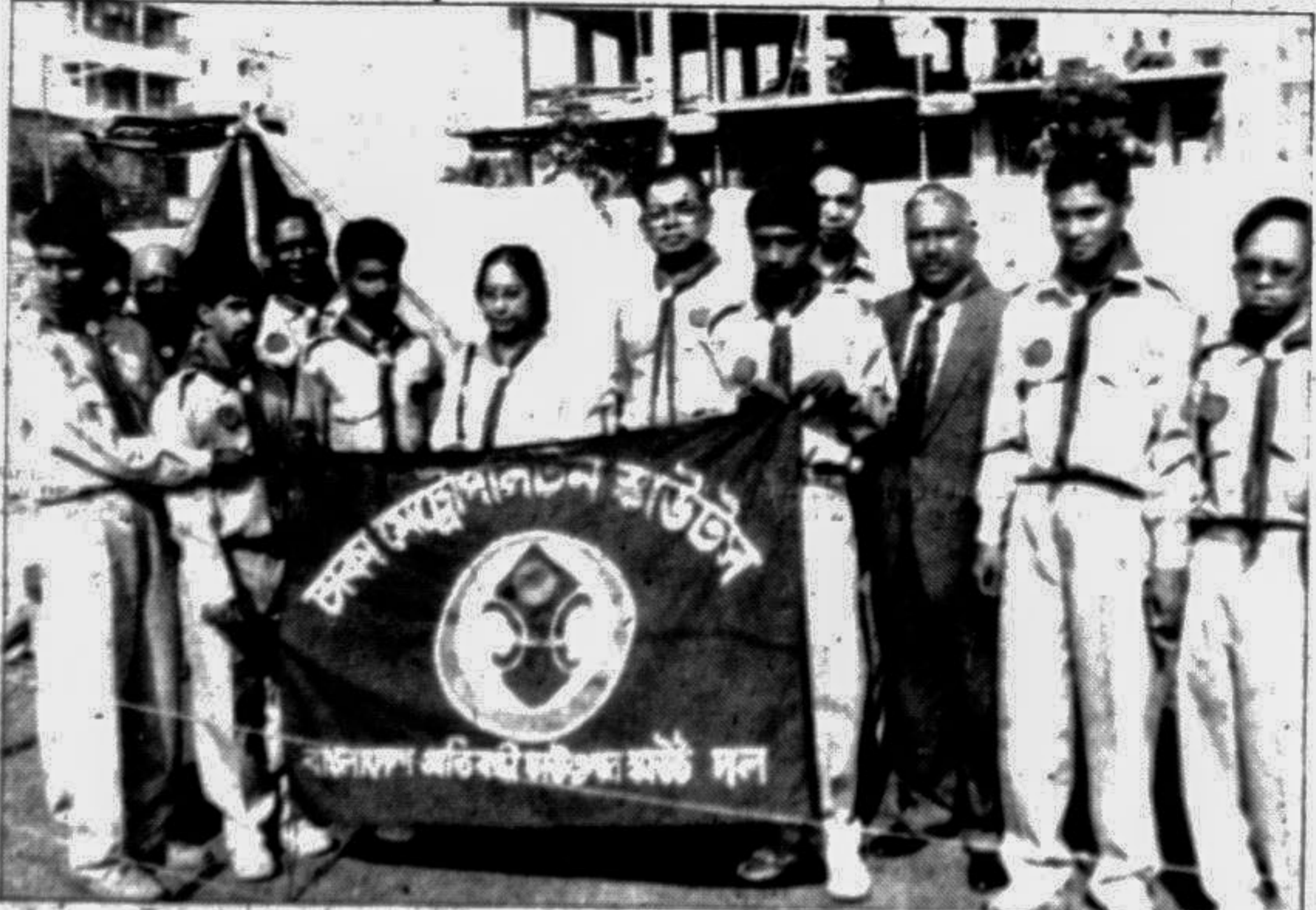
Officials and participants to the first Dhaka regional convention of the retarded scouts held at city's Mohammadpur Govt High School yesterday.