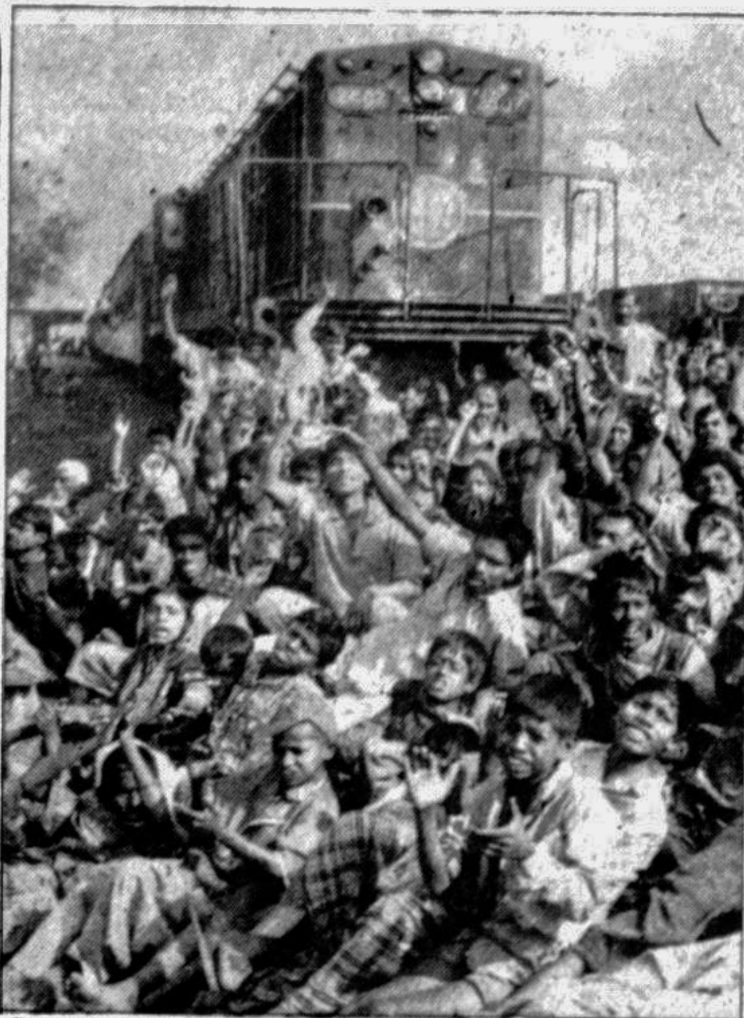
Pickets obstructing movement of an intercity express train at the outskirts of the city, Tongi, during the countrywide road-rail-waterways barricade programme called by the mainstream opposition parties.