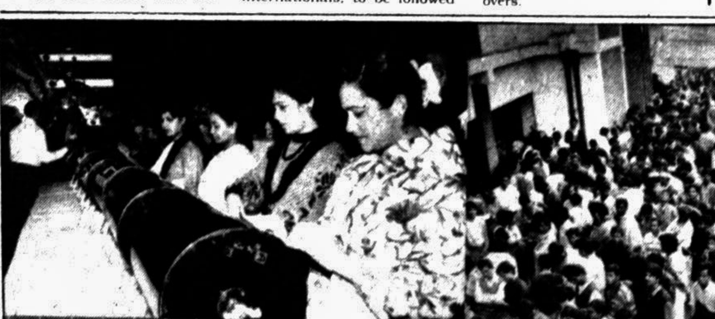
FATE ON THE MAKE: Lucky draw of the National Sports Council's (NSC) sixth raffle is being conducted. While the pretty faces put millions' luck in a whirlpool of blind fortune, enthusiasts and those who never stop hoping even if it is against hope itself throng at the NSC premises to know the outcome of the draw yesterday.