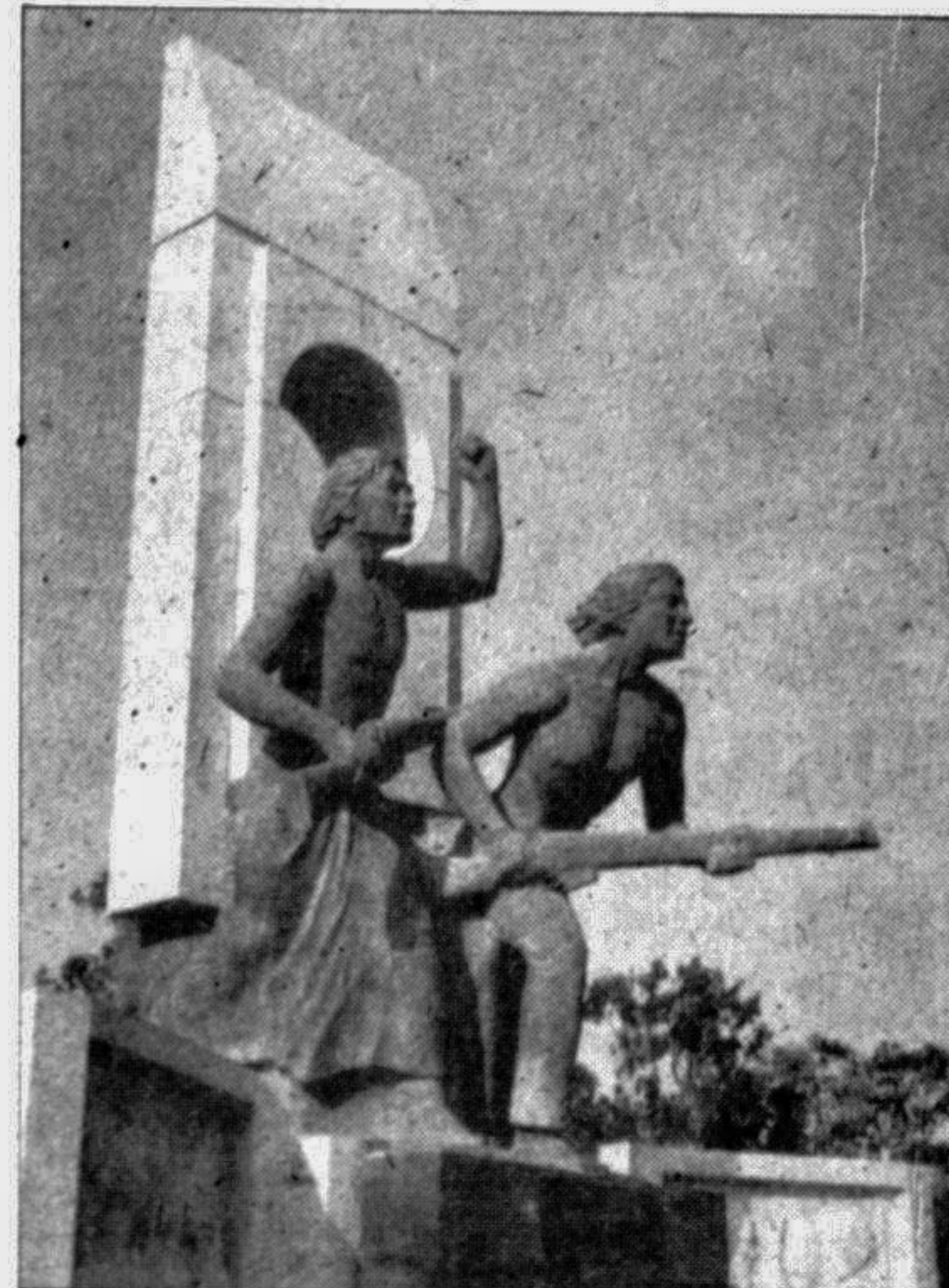
The sabaash Bangladesh monument inside the RU campus

RAJSHAHI UNIVERSITY: Jan 18: Right after the first World War, Sadlar Commission, appointed by the Indian government felt the necessity of establishing a university at Rajshahi region. But for different political reasons the recommendation of Sadlar Commission was not materialised.