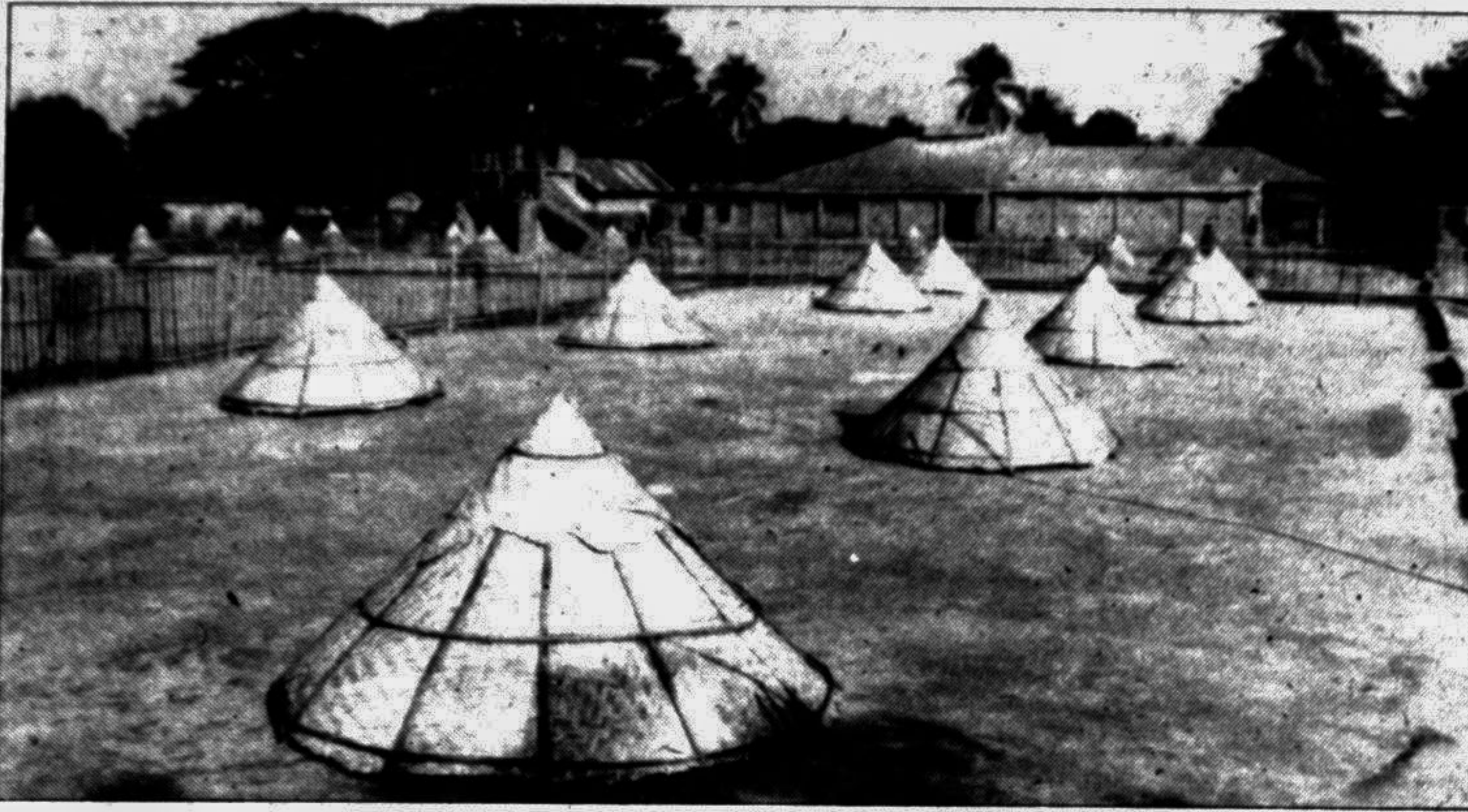
Nothing strange! 'Matla,' as it's popularly known in the area in Hakimpur thana of Dinajpur district. Matla is used to cover paddy in rice mills.