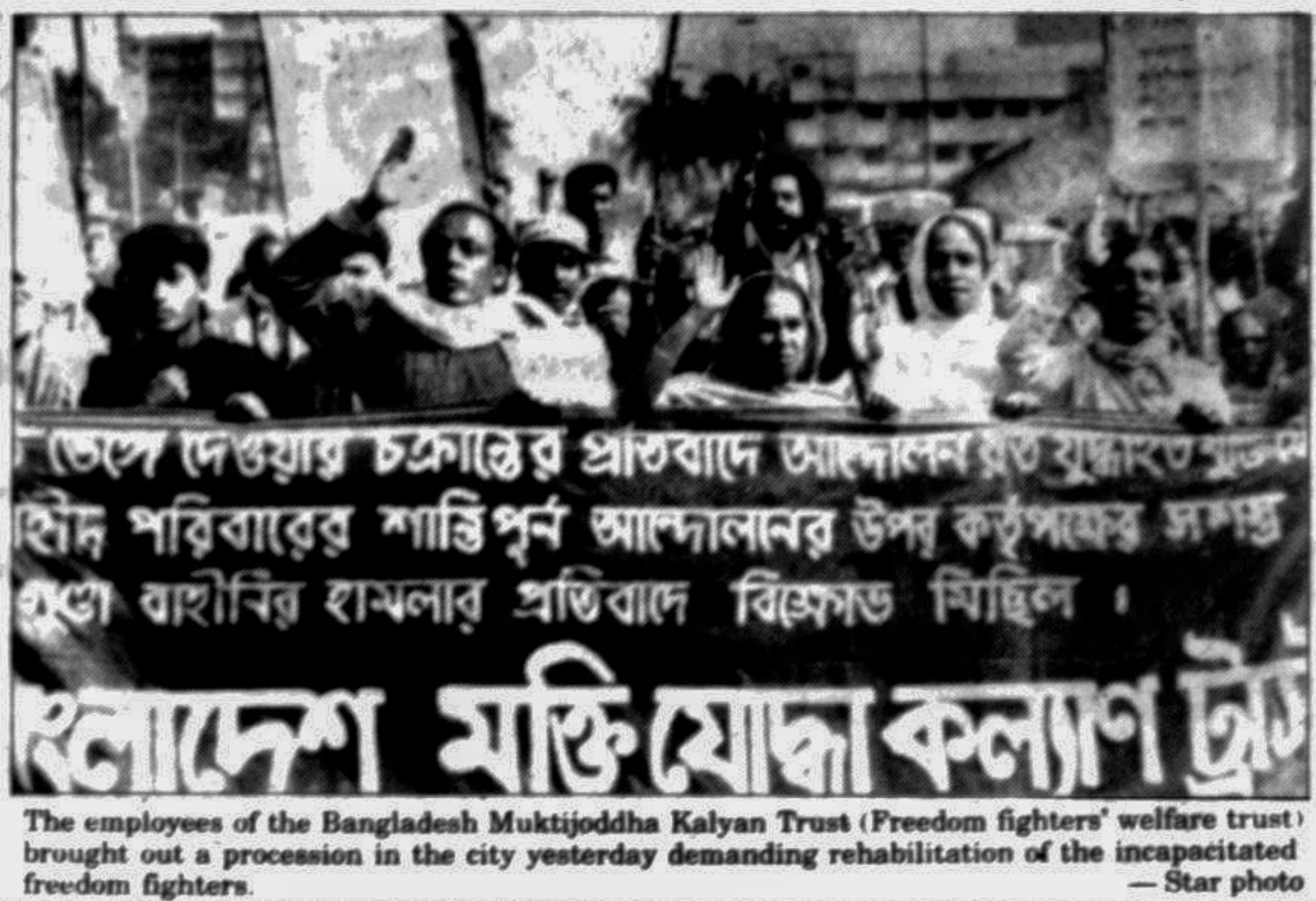
The employees of the Bangladesh Muktiyoddha Kalyan Trust (Freedom fighters' welfare trust) brought out a procession in the city yesterday demanding rehabilitation of the incapacitated freedom fighters.

Machinery gutted Machinery worth about Tk 10 lakh was gutted in a devastating fire at the Bangladesh Livestock Research Institute (BLRI) in Savar yesterday, reports UNB. Fire breaks out at oil mill CHITTAGONG, Jan 18: A fire broke out at an oil mill in the port city today, reports UNB. Fire Brigade and police sources said the blaze first started at the godown of Babu Oil Mills.