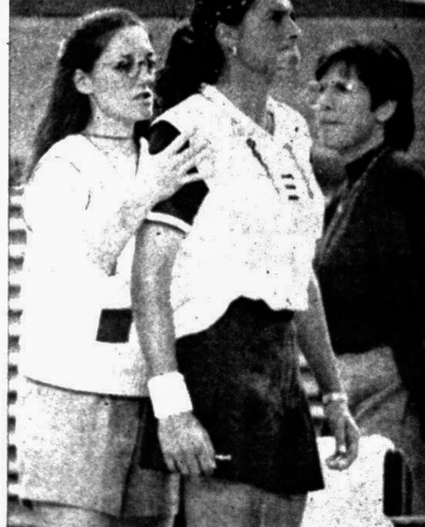
Gabriela Sabatini receives therapy for a strained back during her opening round match at the Australian Open against American Marianne Werdel Witmeyer in Melbourne yesterday. The fifth-seeded Argentine became the biggest casualty to fall on Day Two of the Open losing 6-4, 6-4.

She now meets Japan's Kyoko Nagatsuka, with American 14th seed Amy Frazier looming in the third round. Frazier, like all the seeded women in action on Day One, did not drop a set on her way to Round Two.