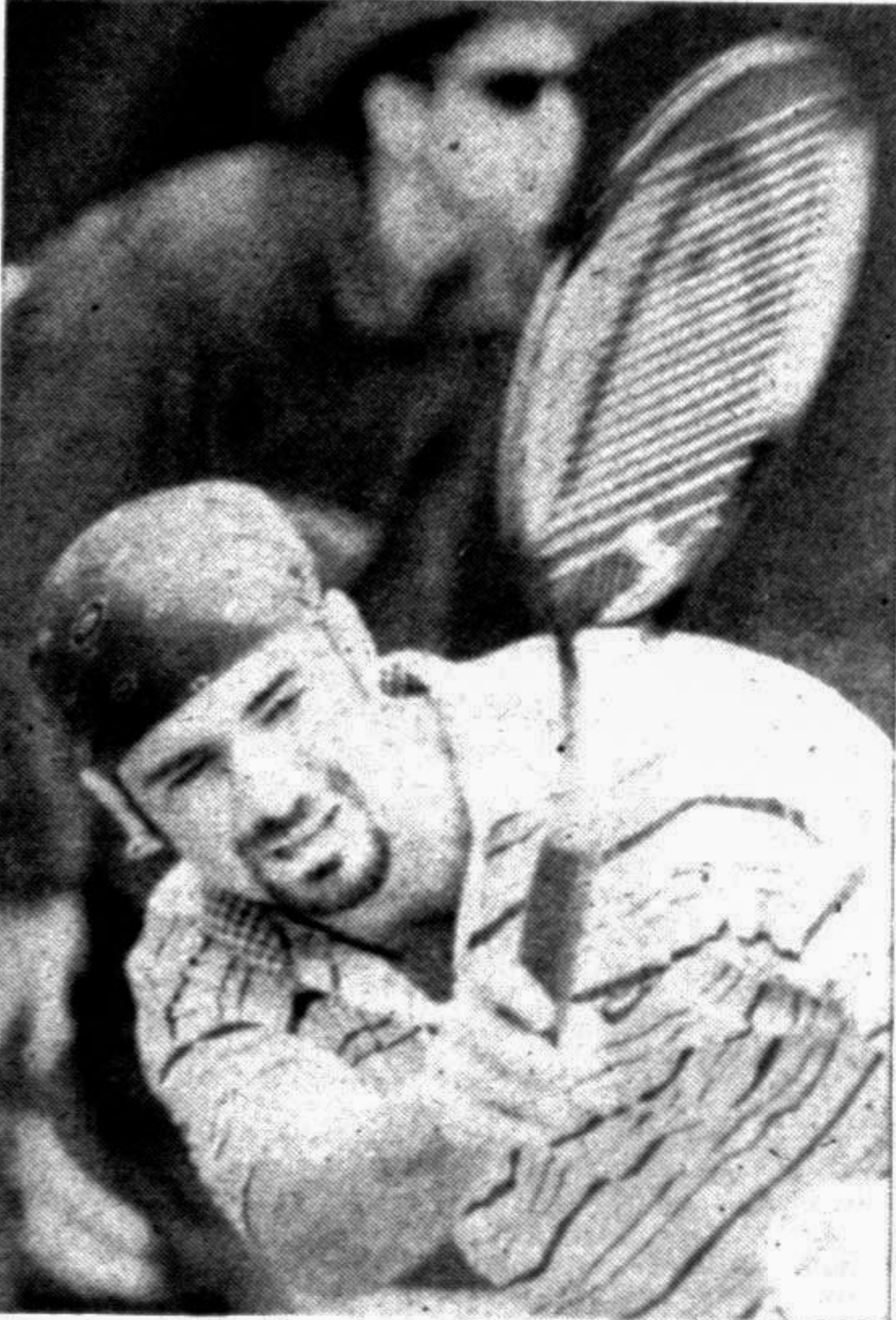
American Andre Agassi goes for a killer against South African Grant Stafford at the Australian Open yesterday. Agassi made an impressive debut at this year's opening Grand Slam event winning in straight sets 6-2, 6-4, 6-2.

McEnroe's current form suggests he could live with most of his compatriots and he His second round opponent will be Britain's Jeremy Bates