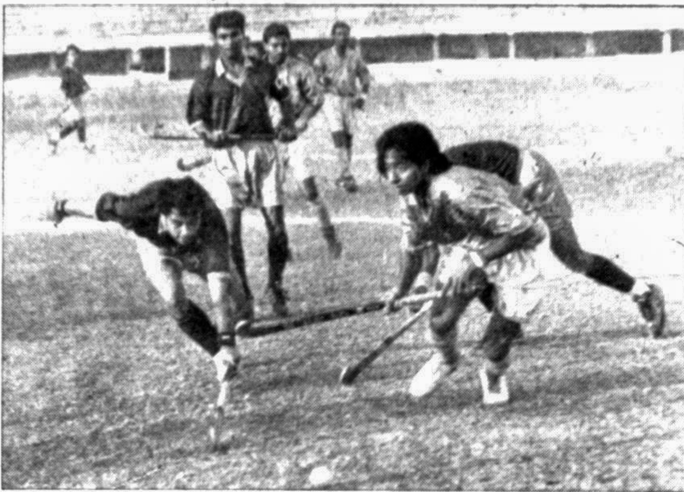
Action from yesterday's Green Delta Insurance First Division hockey league encounter between holders Abahani and Dhaka Mariner Youngs Club at the Hockey Stadium. Mariners edged the champions 2-1.

Sports Reporter Defending champions Abahani Krishna Chakra ended their preliminary round robin league campaign on a sour note when Dhaka Mariner Young's Club handed them a 2-1 defeat in one of the two Green Delta Insurance First Division hockey league matches at the Hockey Stadium yesterday.