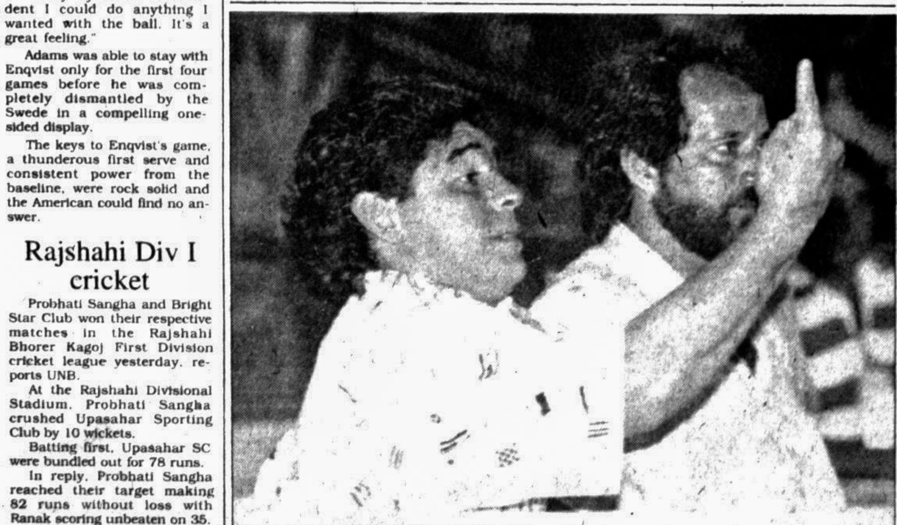
Former Argentine soccer star Diego Maradona gives instructions to his players on his coaching debut at Racing Club during their match against Independiente in Mar Del Plata on Jan 14. The teams split points in a goalless encounter.