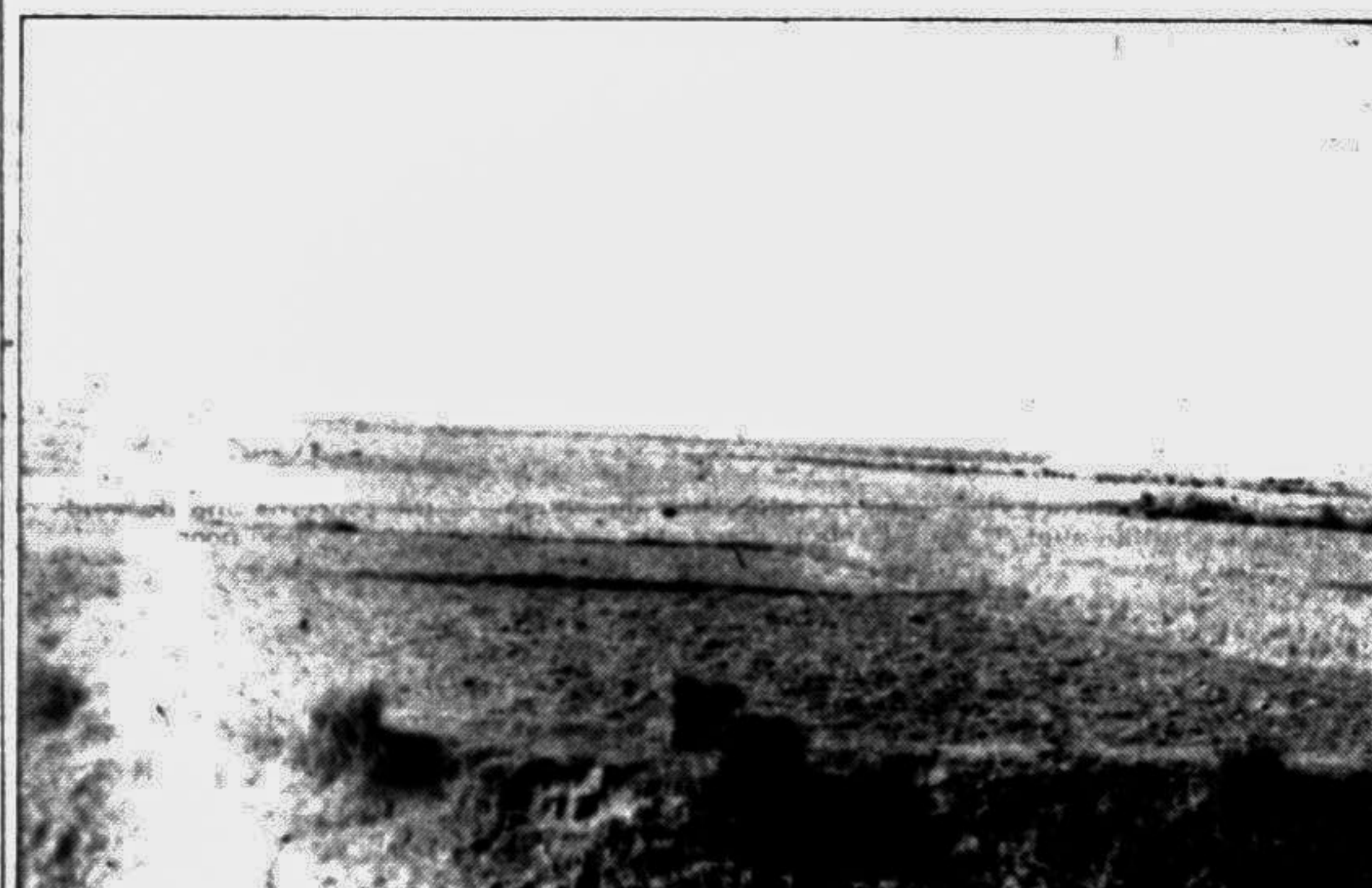
BARISAL: The green land-scape of Char-Zahiruddin where hundreds of farmers pass days in fear of any attack by the lathials.

During that atrocity of the armed lathials not less than two thousand residents of Bashir colony, Patwary colony