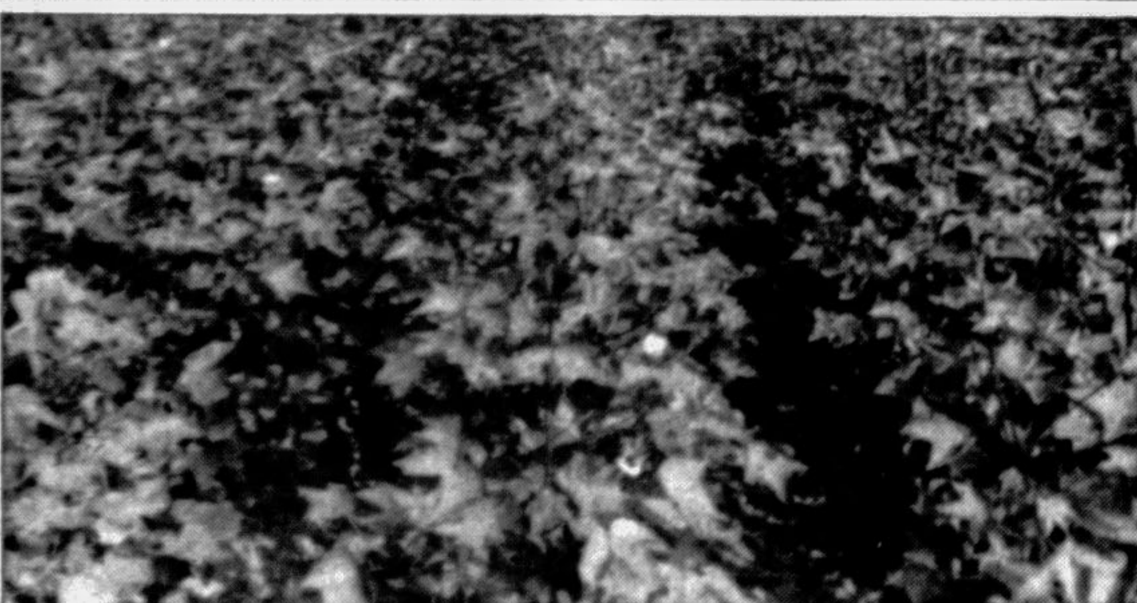
RAJSHAHI: This year cotton output from Rajshahi region is expected to be very good. A bumper cotton production is expected from the region.

The only one venue for the cultural activities is the amphitheatre. But it is not sufficient for about 4000 students and nearly 250 teachers. The students and teachers, face space constraint at the amphitheatre while enjoying a programme. Besides these, ac-