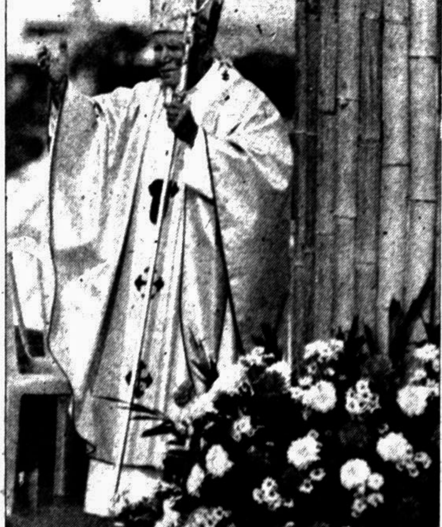
Pope John Paul II blesses the congregation from the altar decorated with local bamboo and flowers at the start of Mass yesterday on the grounds of the Philippines International Convention Centre. A crowd of approximately half a million came to see the Pope and celebrate Mass.

She was accompanied by Communications Minister Oli Ahmed, Education Minister