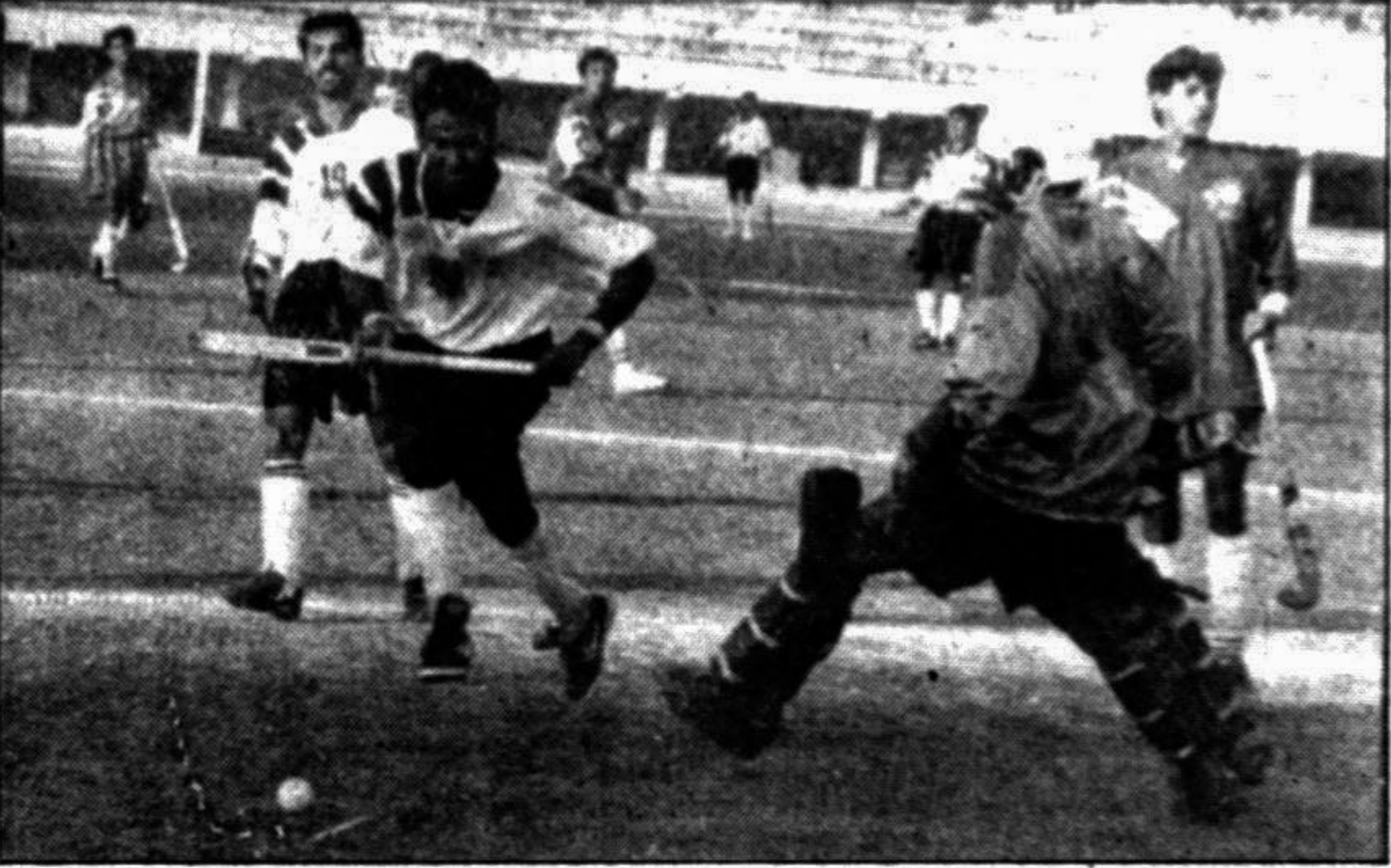
A goalmouth melee during yesterday's Green Delta Insurance First Division hockey league encounter between Mohammedan Sporting Club and Usha Krira Chakra at the Hockey Stadium. Mohammedans won the match 2-1.