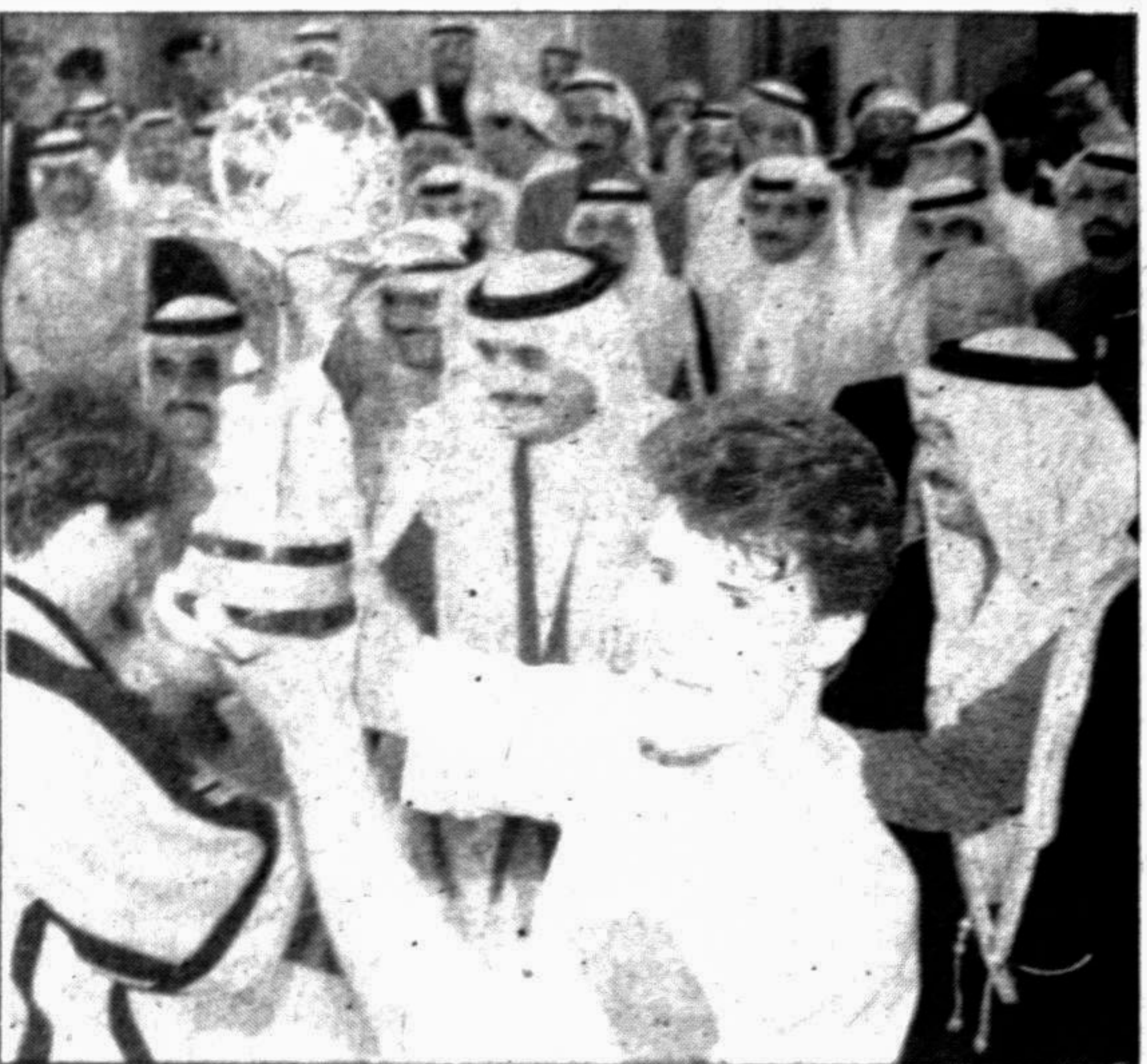
Danish captain Brian Laudrup displays the trophy after beating Argentina in the final of the Intercontinental Cup soccer tournament in Riyadh on Jan 13. Denmark won the match 2-0.