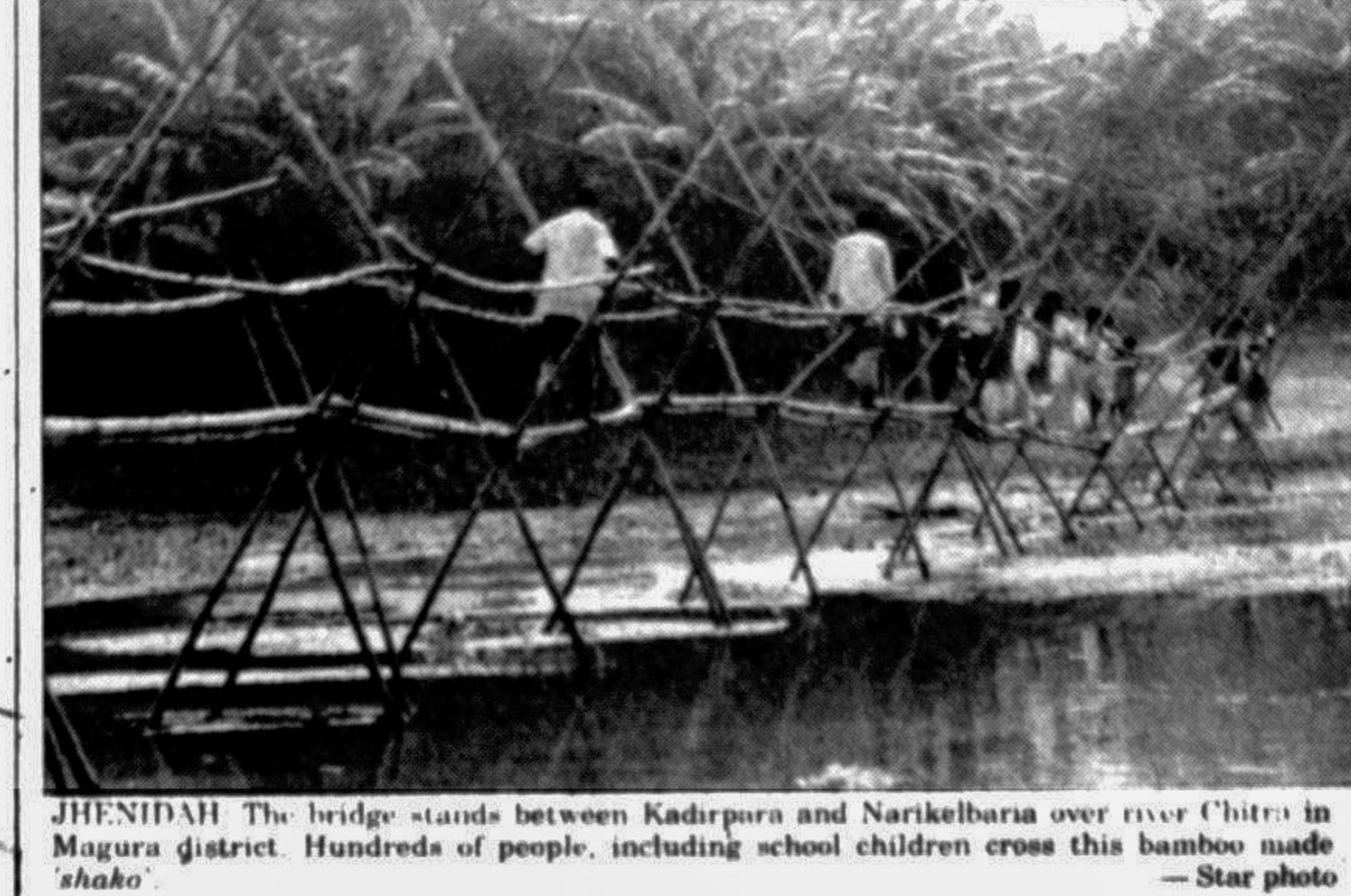
JHENIDAH: The bridge stands between Kadipara and Narikelbaria over river Chitra in Magura district. Hundreds of people, including school children cross this bamboo made 'shako'.