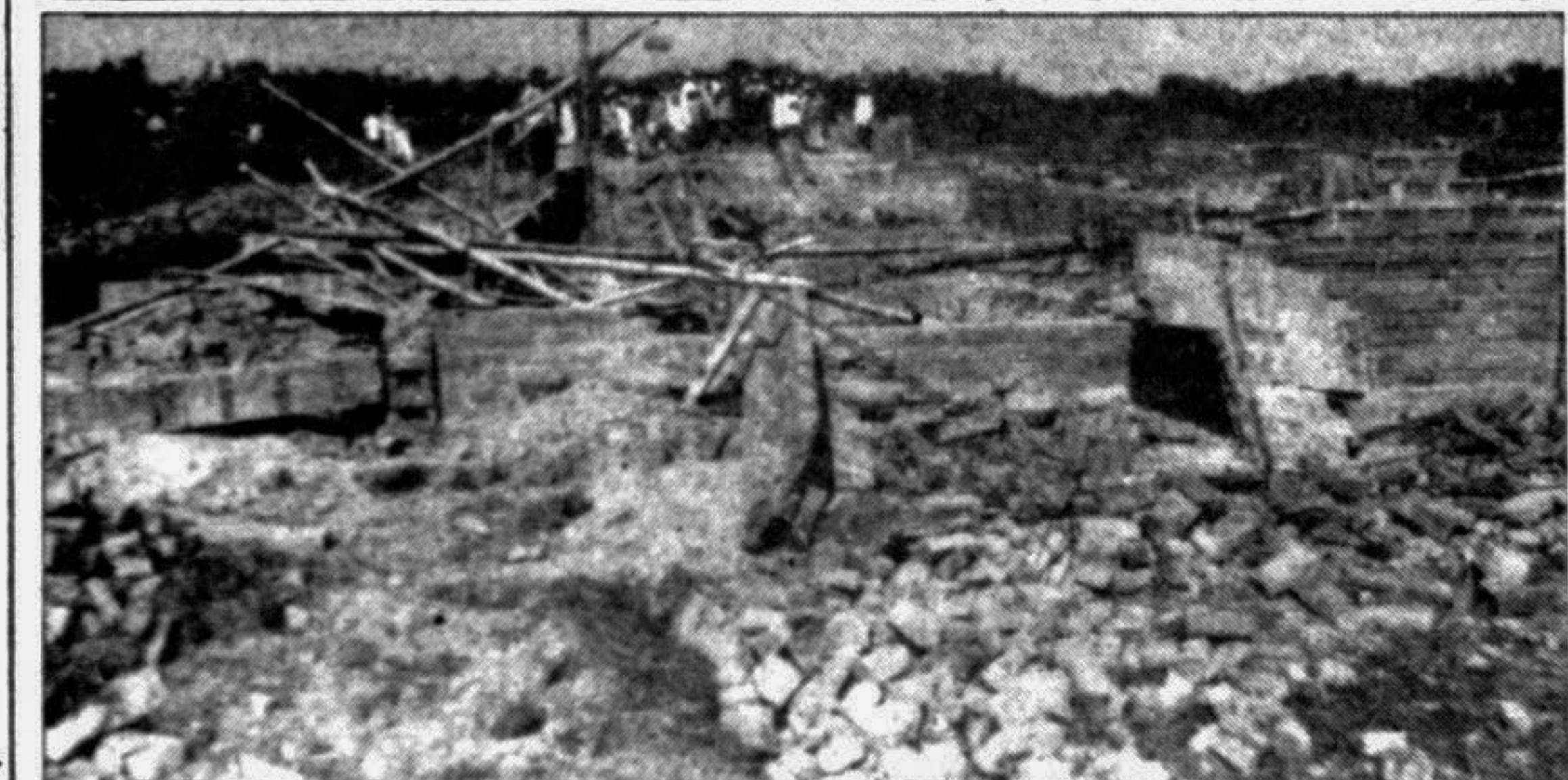
SYLHET: An organised gang of miscreants allegedly damaged Shah Khurram College buildings at Takerbazar on Friday last.