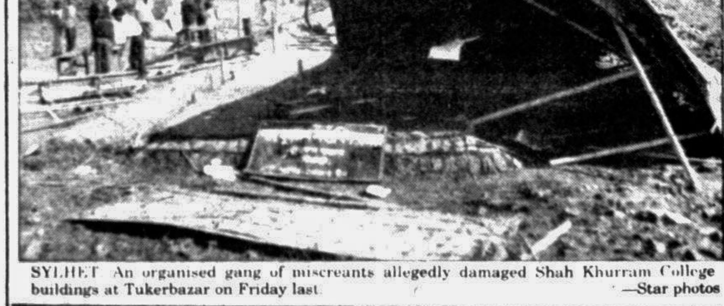
SYLHET: An organised gang of miscreants allegedly damaged Shah Khurram College buildings at Takerbazar on Friday last.