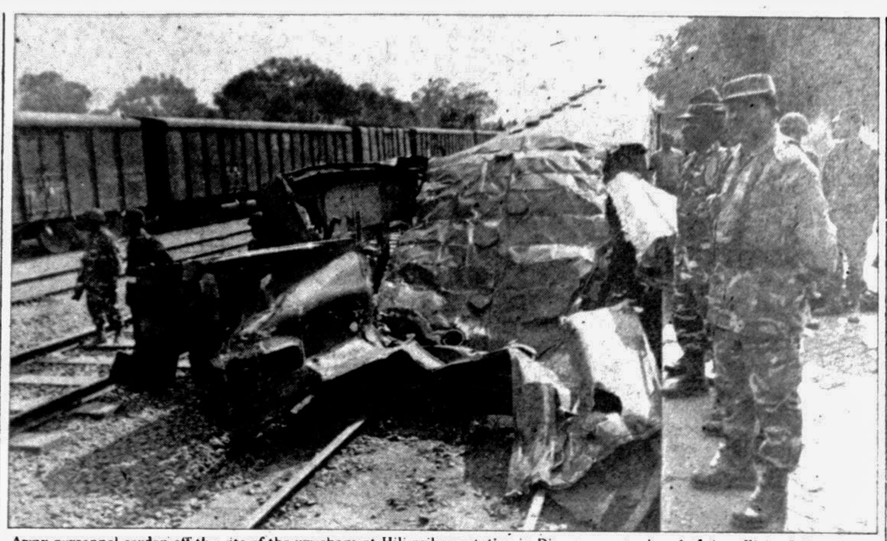
Army personnel cordon off the site of the wreckage at Hili railway station in Dinajpur yesterday. A train collision left at least 25 people dead.

HBFC distributes Tk 105.10cr loan The House Building Finance Corporation (HBFC) has distributed Taka 105.10 crore as loans during the first six months of the current fiscal. The house building loans distributed from July 94 to December 94 are 42.88 per cent more than those distributed during the same period of the previous fiscal, reports BSS.