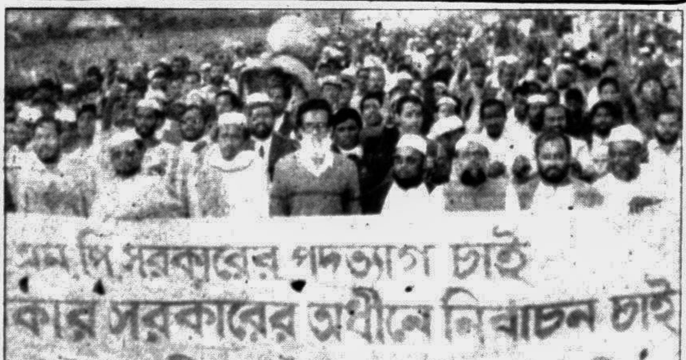
The Jamaat-e-Islami Bangladesh brought out a 'padajatra' (street march) in the city yesterday reiterating its demand for elections under a caretaker administration.