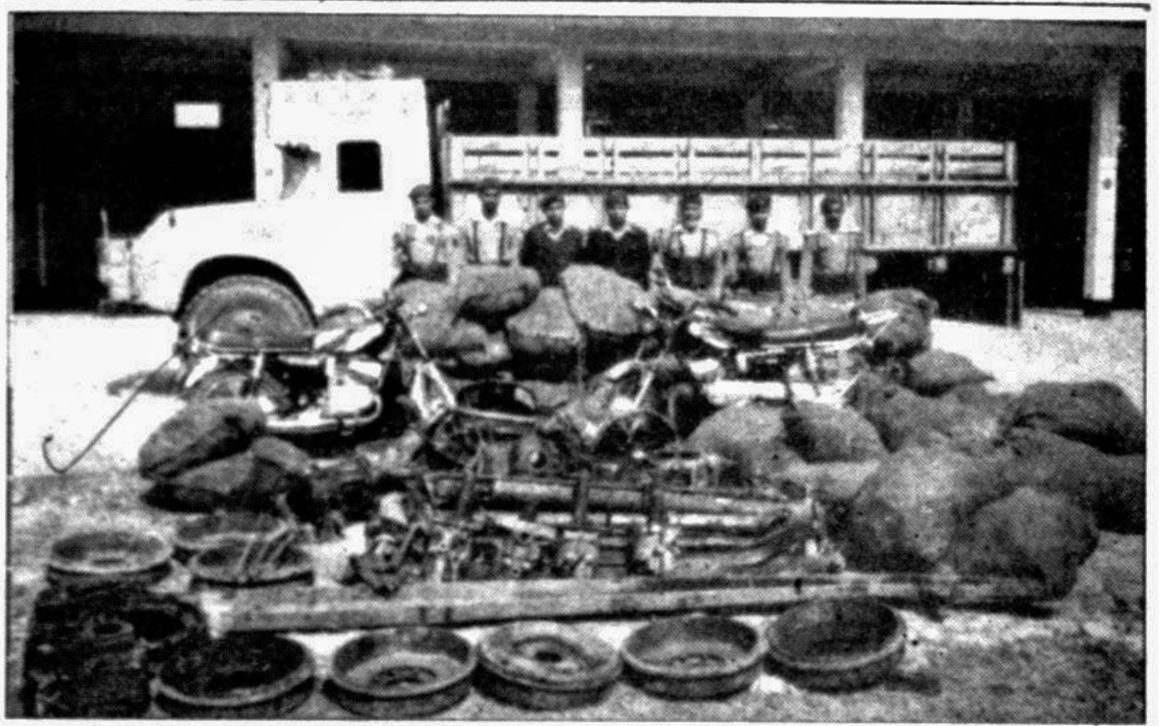
JESSORE: A truck carrying smuggled Indian motor parts was seized by the BDR in late December, 1994 from Benapole border.

A reliable source said, in many cases real cause of death either suicide or murder can not be identified for want of enough evidence. Police investigations are very weak in most of the cases, the source said. Talking to a high official of police Department it was learnt that in areas where pesticides or insecticides are used widely, number of suicide is higher there, as the victims can procure the same easily. A survey also revealed that most of the cases happened between the Bengali month of Baisakh and Ashwin. In this period farmers are compelled to purchase pesticides to spray in their fields. Recently even in winter season good quantity of pesticides are being sprayed on vegetables fields, the source said. Availability of pesticides is also responsible for most of the cases, the sources said.