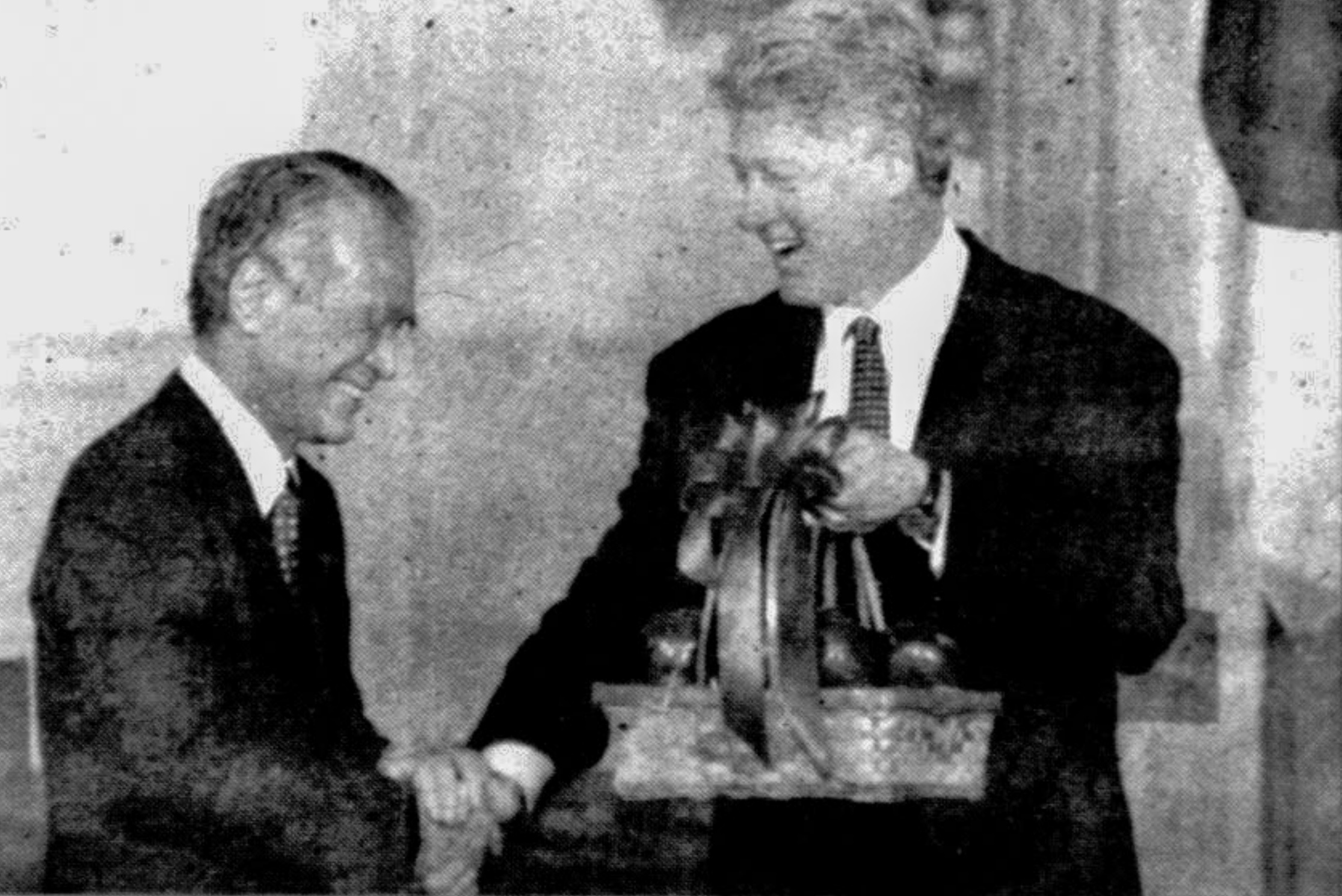
US President Bill Clinton (R) shakes hands with Japanese Prime Minister Tomichi Murayama and presents him with a basket of apples after a joint press conference at the White House on Wednesday...

China has objected strenuously, saying the US demands are excessive and go beyond what the United States itself has done.