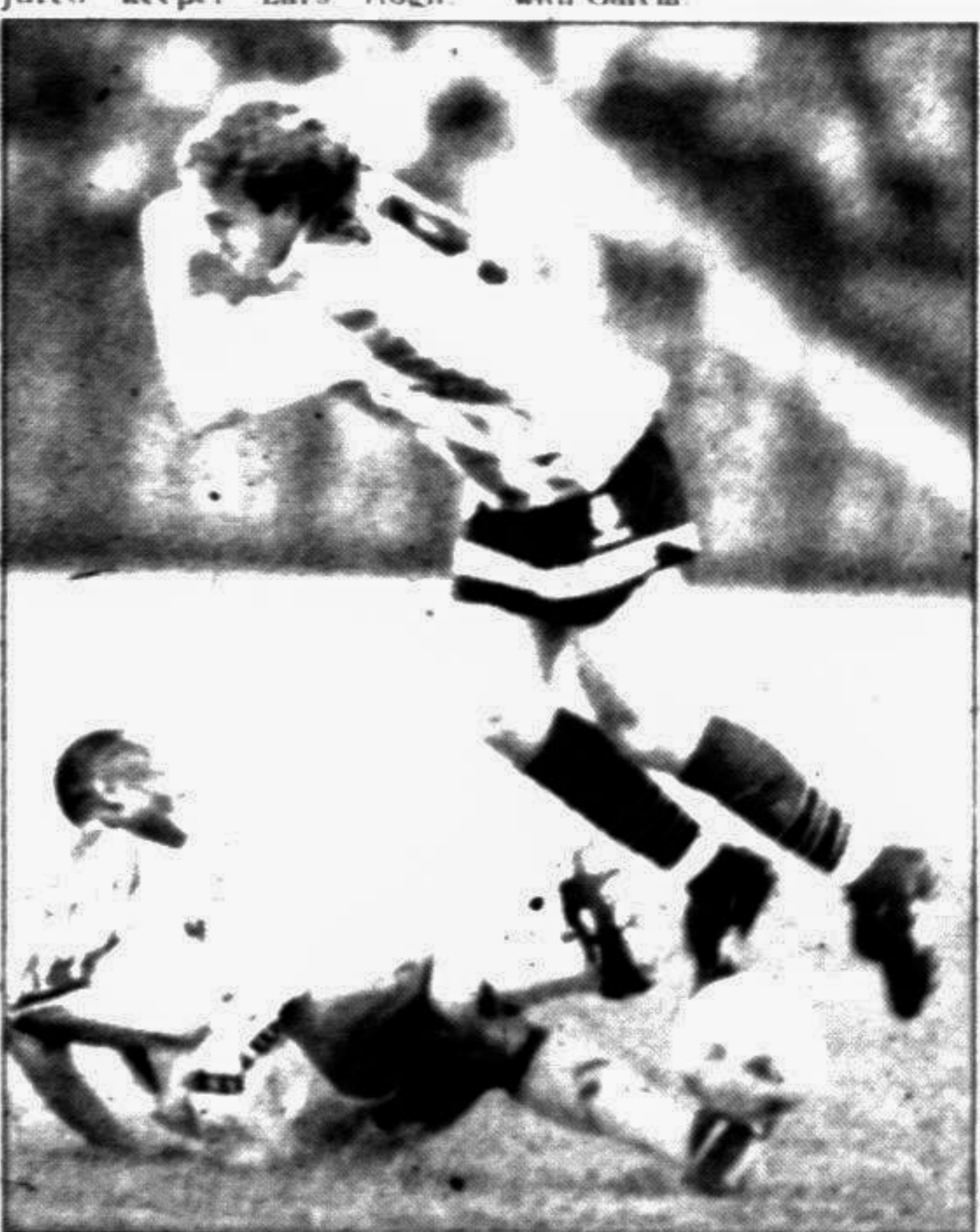
Argentine striker Gabriel Batistuta dives after being tackled by Nigerian player Efan Ekoku during their intercontinental Cup encounter in Riyadh on Jan 10. Final score was 0-0 and the South American champions moved in to Friday's final against Denmark.