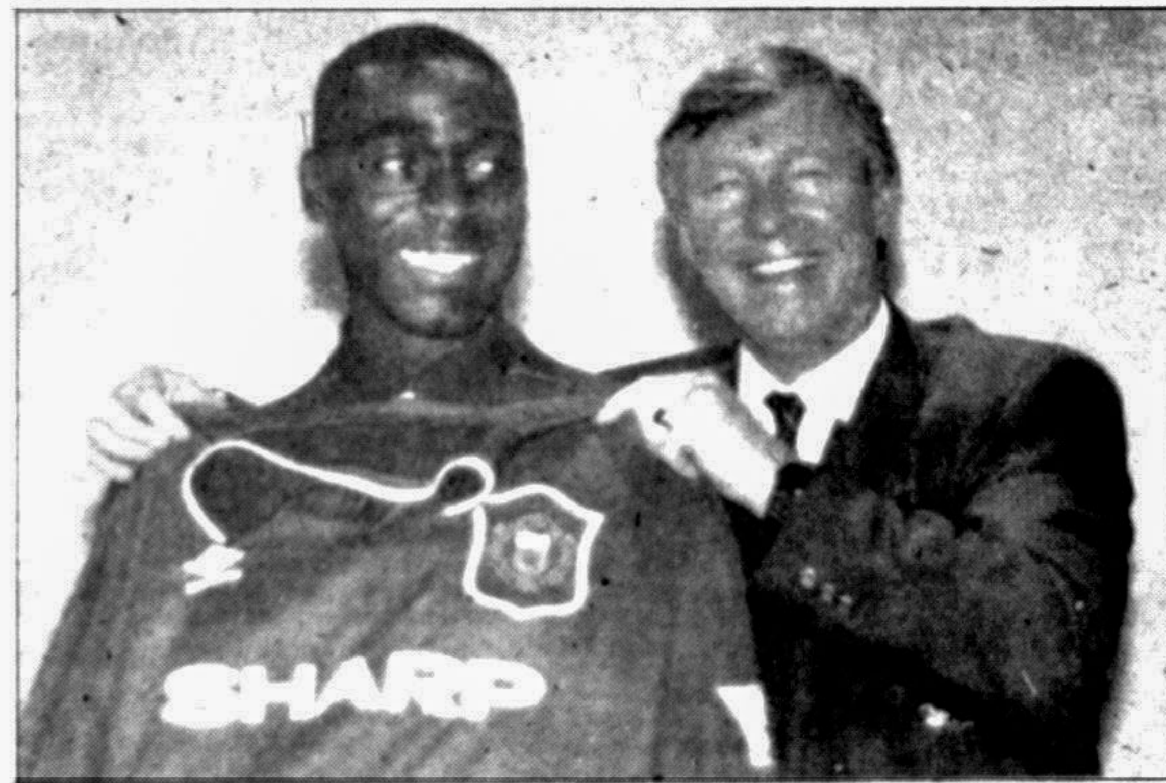
Manchester United manager Alex Ferguson introduces new signing Andy Cole at United's Old Trafford ground on Tuesday. Cole joins the English Premier league champions from Newcastle United for a record British transfer fee of six million pounds thus making the 23-year-old striker the most expensive player in the country.