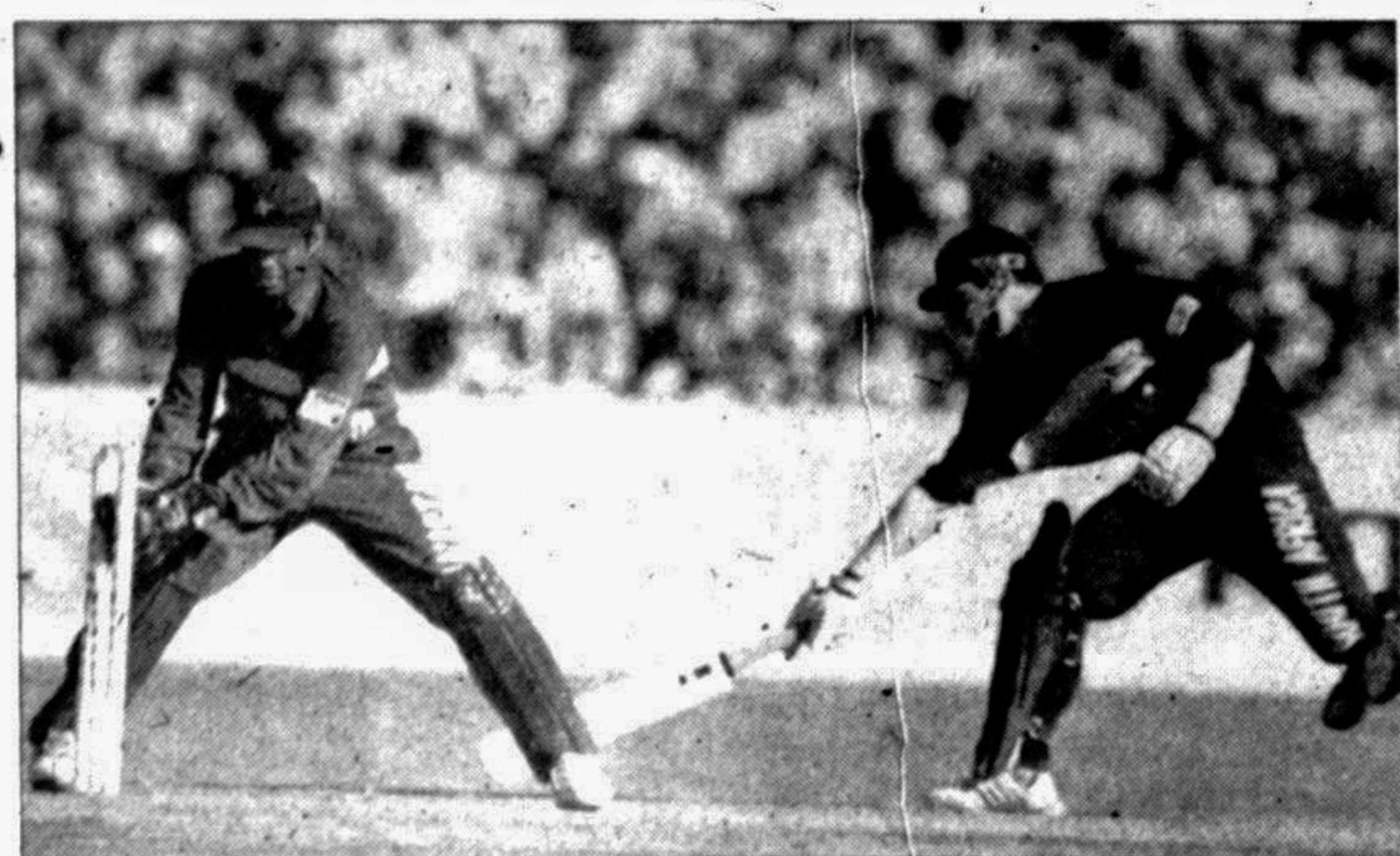
South African batsman Daryll Cullinan falls short of his ground as Pakistani stumper Rashid Latif smartly whips the bails off during the best of three finals opener in Cape Town on January 10. One-day world champions Pakistan lost by 37 runs.

The match ended in a goalless draw. Both teams collected one point each from two matches in Group C.