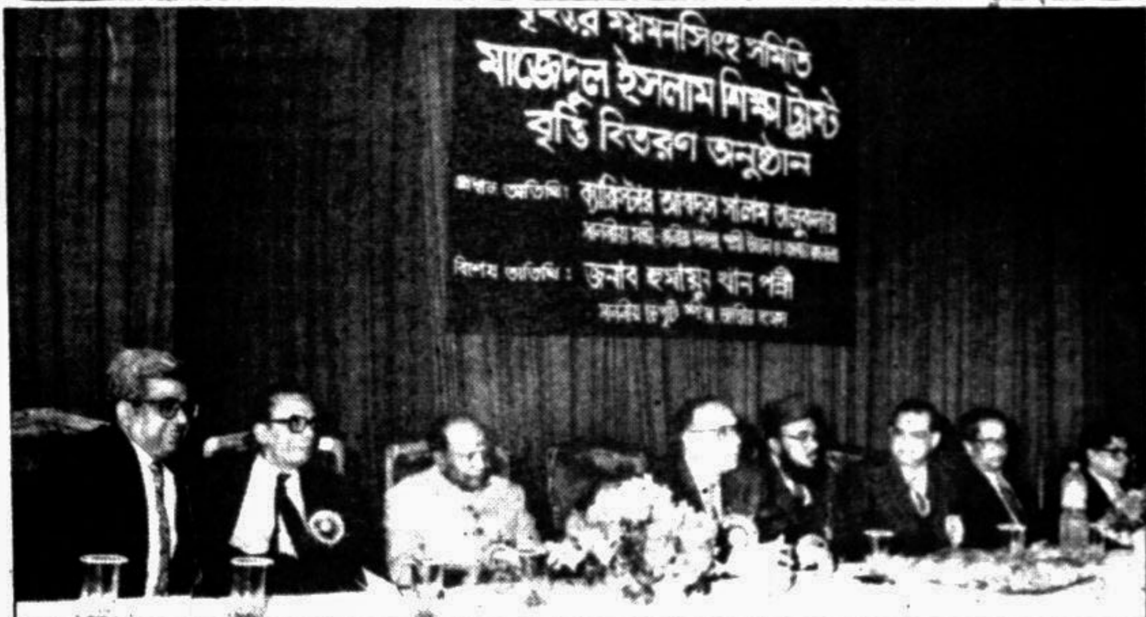
The stipend distribution ceremony of Mazedul Islam Education Trust was held yesterday in the city. Minister for Local Government, Rural Development and Co-operatives, Abdu Salam Talukdar was present at the chief guest. Deputy Speaker of the Jatiya Sangsad, Humayun Khan Panni was the special guest.

Students of the university willing to attend the convocation have been asked to submit applications and registration fees to the Registrar Office by January 19.