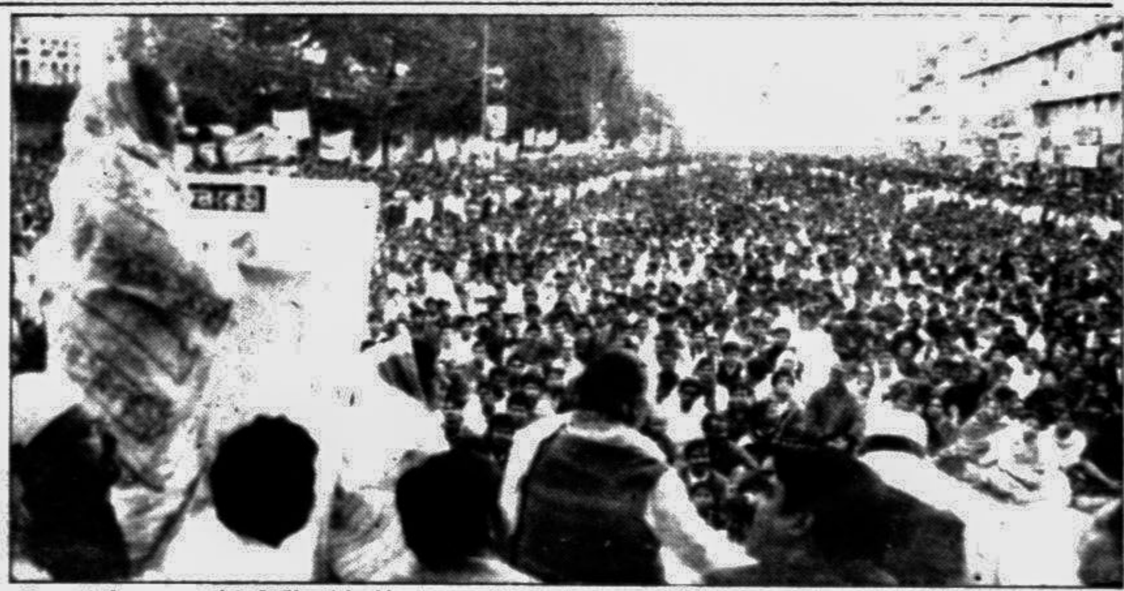
Awami League chief Sheikh Hasina addressing a public meeting organised to mark the home-coming day of Bangabandhu Sheikh Mujibur Rahman at Bangabandhu Avenue in the city yesterday.

"It is only a personal assumption, based on the length. See Page 12 Col 1