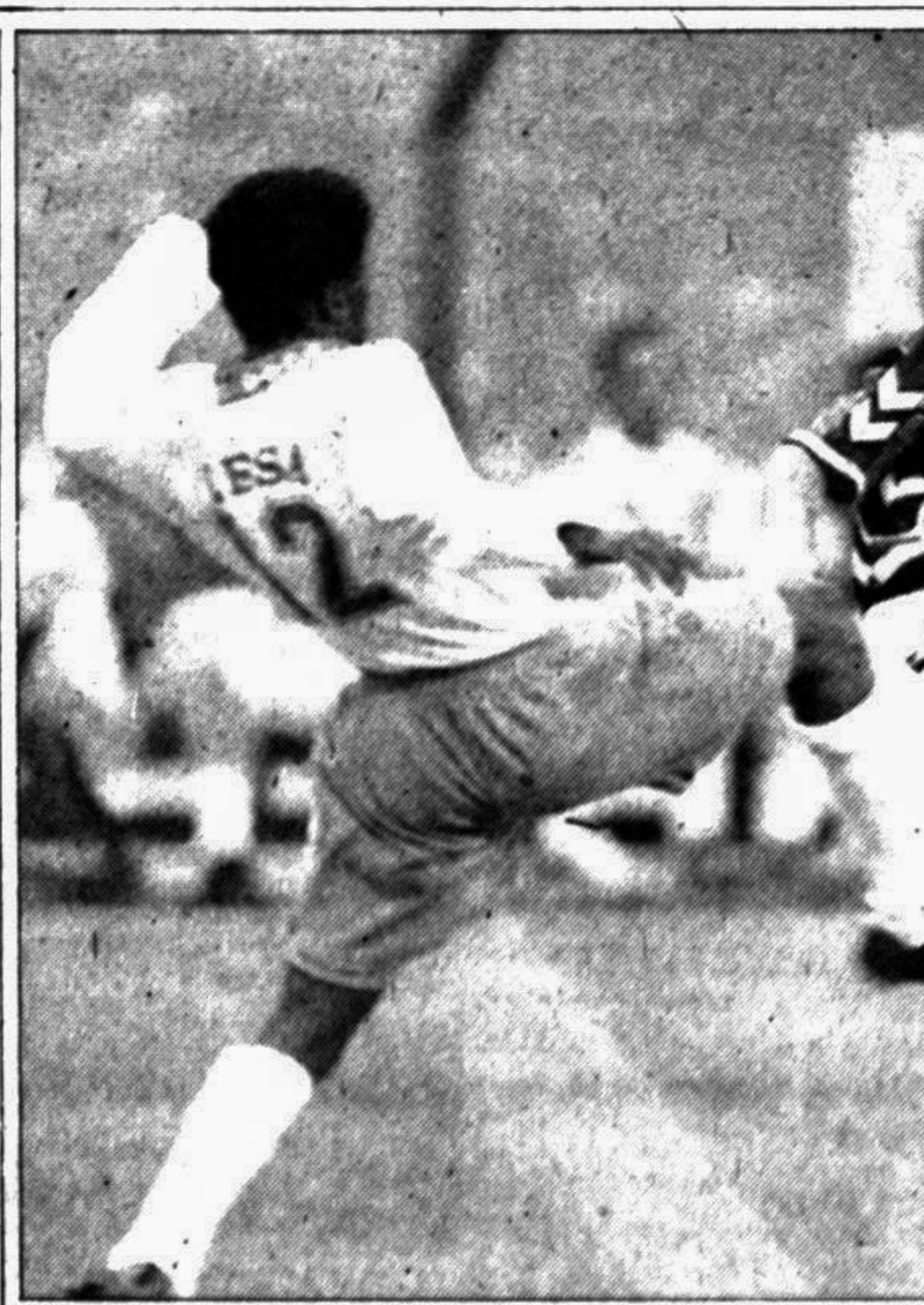
Danish captain Brian Laudrup (R) and Saudi defender Mohammed Al Khilawi are involved in a mid-pitch duel for the ball during their Intercontinental Cup football tournament match in Riyadh on Jan 8. European champions Denmark won 2-0.

A further point behind Bremen, on 22 points from 17 matches, are Kaiserslautern, who could only manage a 1-1 draw at home to struggling 1860 Munich on Friday.