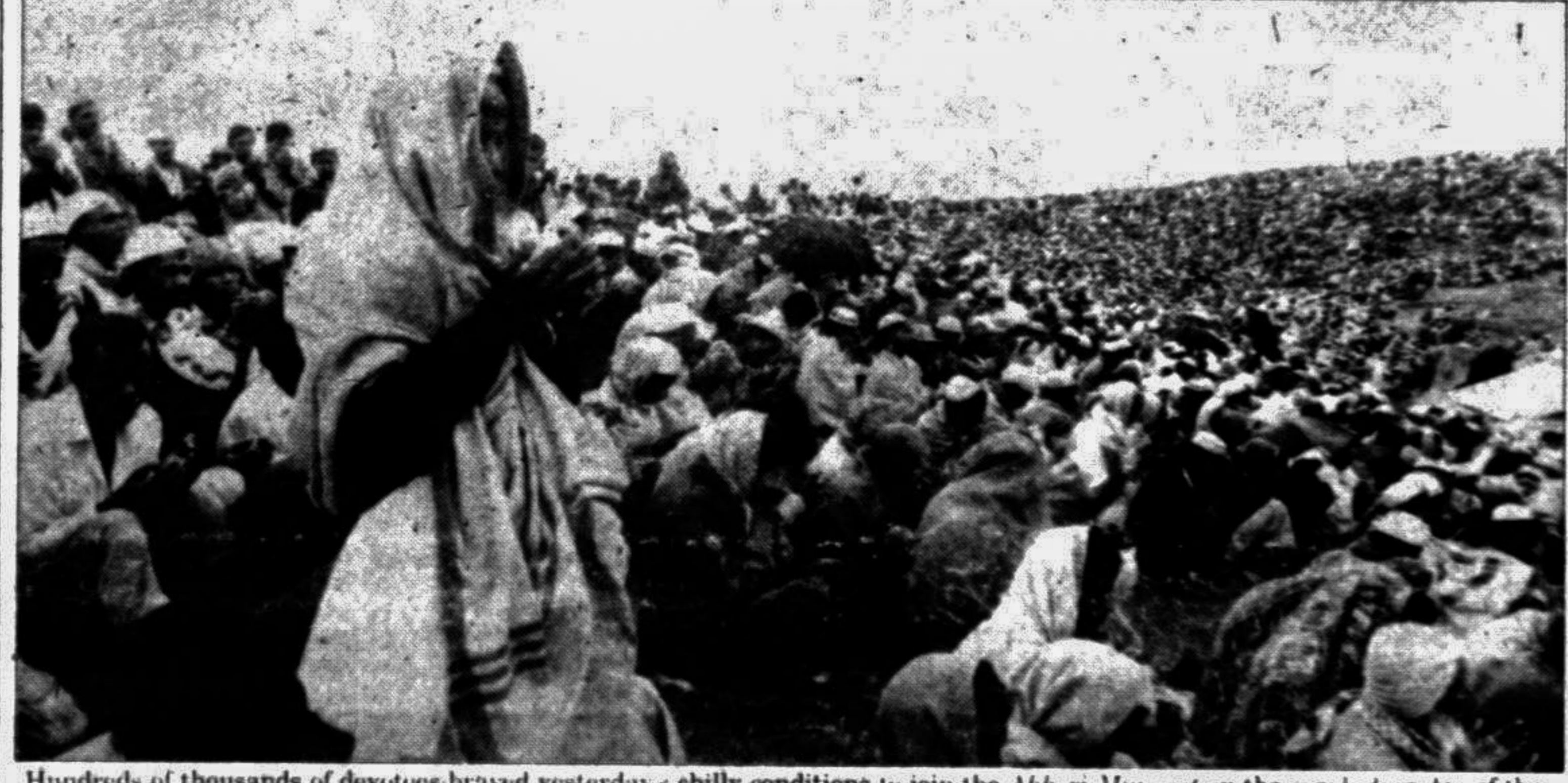
Hundreds of thousands of devotees braved yesterday's chilly conditions to join the Akheri Munajat on the concluding day of the three-day Biswa Ijtema at Tongi.

The cabinet has approved the draft Bills of Battalion Ansars Act 1995, Ansars Bahini Act 1995 and the Gram Pratirakkha Dal Act 1995. The enhanced benefit packages for battalion Ansars as well as embodied Ansars were also approved, reports BSS. The approvals were given at the weekly cabinet meeting held last night at the Bangabhaban with Prime Minister Begum Khaleda Zia in the chair. The cabinet also approved in principle the draft Bill of National Book Centre Act 1995. Ministers, state ministers in charge of different ministries and divisions, Cabinet Secretary, Principal Secretary to the Prime Minister and concerned secretaries were present in the meeting.