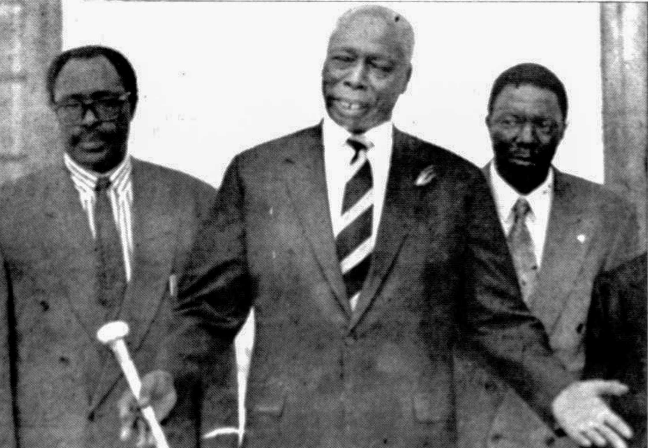
Kenya's President Daniel Arap Moi, (C), Rwandan President Pasteur Bizimungu, (L) and Sylvester Ntibantunganya President of Burundi, (R) pose at the Presidential Palace on Saturday prior to the start of a one-day summit to discuss how to persuade hundreds of thousands of Rwandan refugees to return home.

HANOVER, Germany, Jan 8: A mother and her three children died on Sunday when a fire swept through a home for asylum seekers in the northern German town of Mellendorf, near Hanover, police said, reports AP.