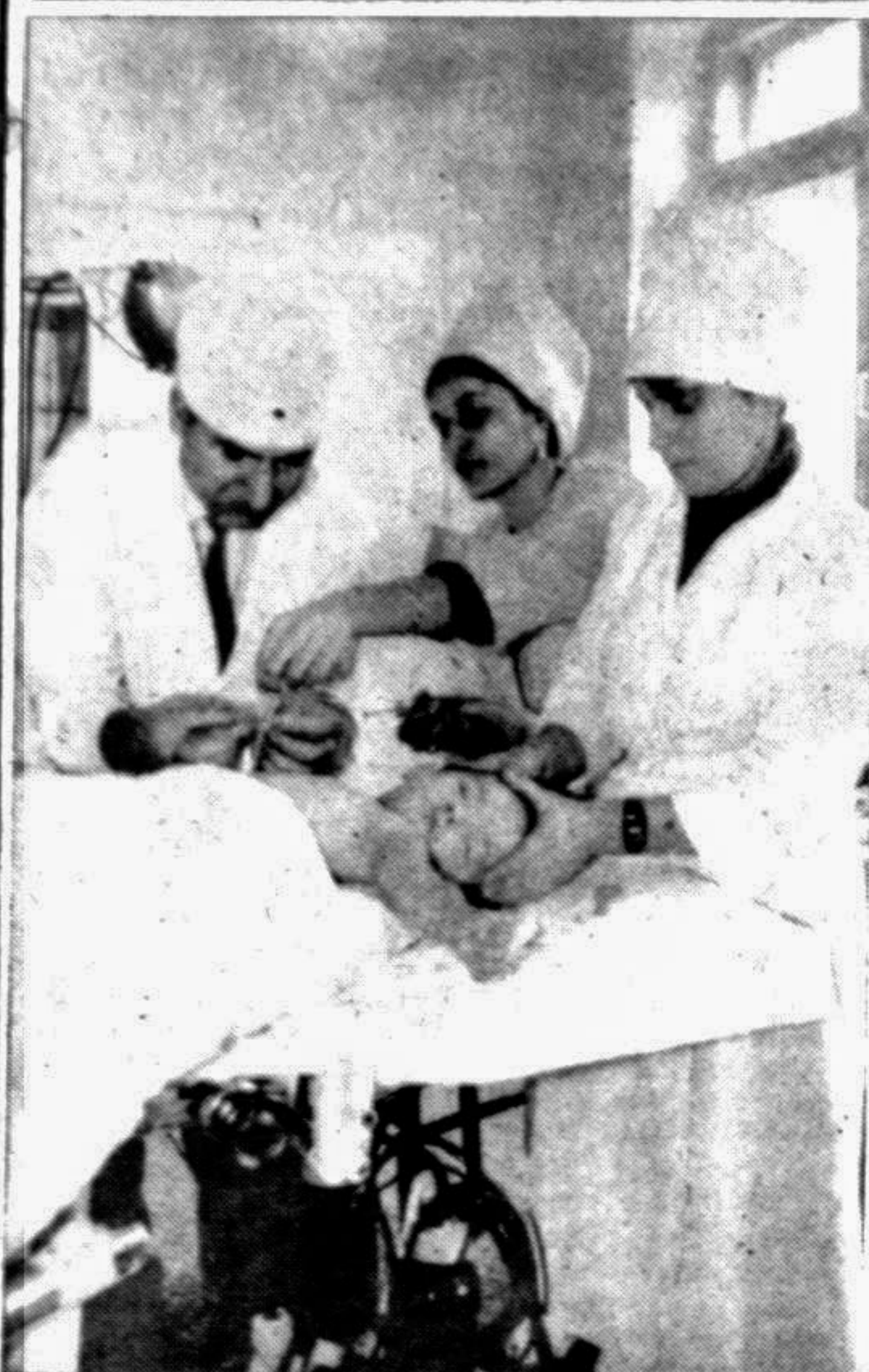
Doctors and nurses prepare for an operation a Chechen girl injured during the battles in Grozny after she was evacuated to a hospital in Khasavyurf on Saturday.

Clinton's popularity on rise: President Bill Clinton's approval rating rose six percentage points from last month to 47 per cent, according to a Cable News Network, Time Magazine poll released on Saturday, AFP reports from Washington.