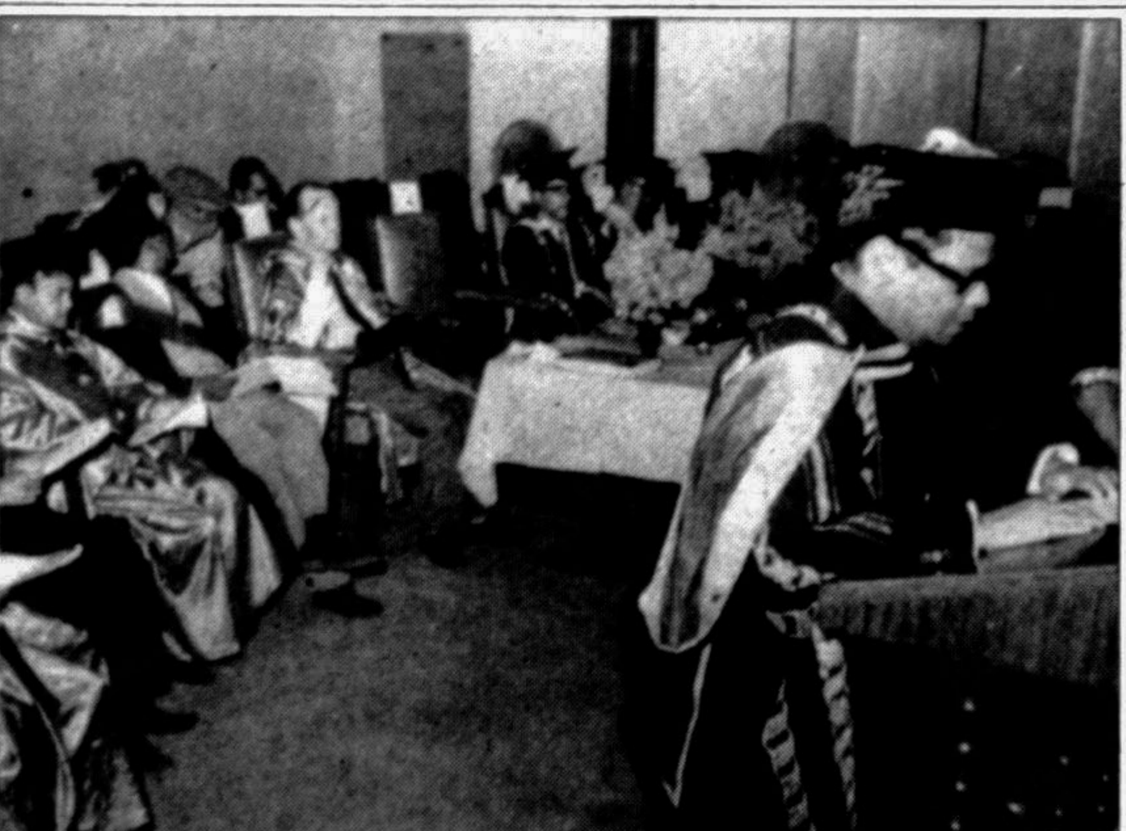
RAJSHAHI UNIVERSITY: Former president and then chancellor Justice Abu Sayeed Chowdhury addressing at the special convocation ceremony arranged in honour of Andrew Malrow in 1973.